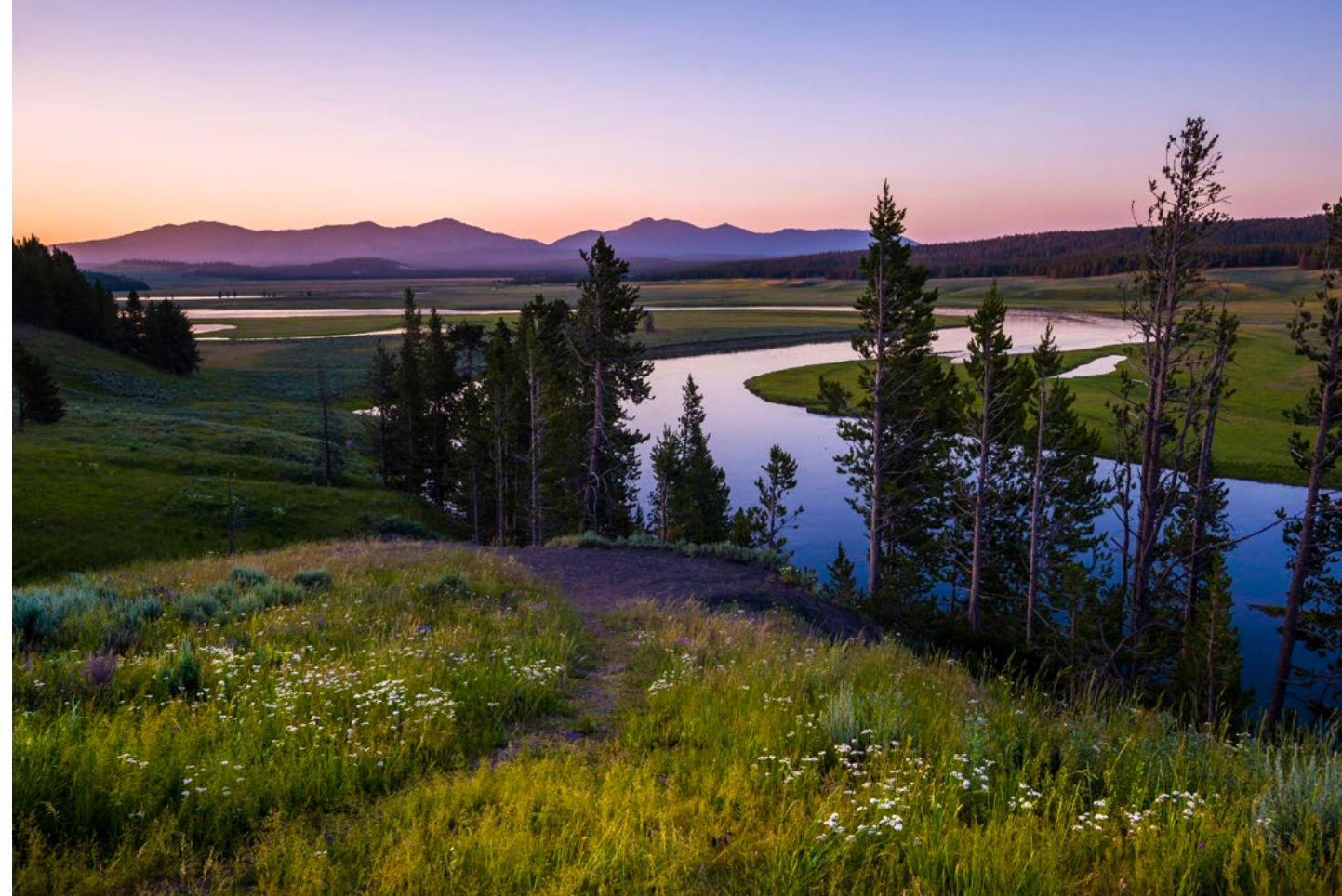
View of Yellowstone River in Hayden Valley (above); Lower Falls at Artist Point (top right)