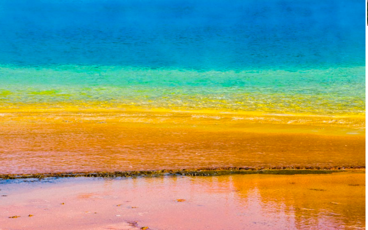
Thermophiles in Grand Prismatic Spring at Yellowstone National Park