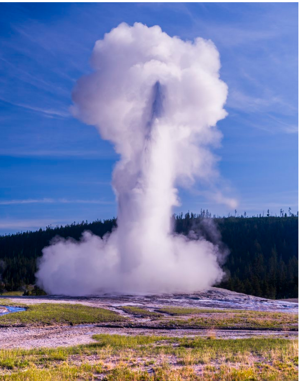
Old Faithful erupts (above); Upper Falls (right)