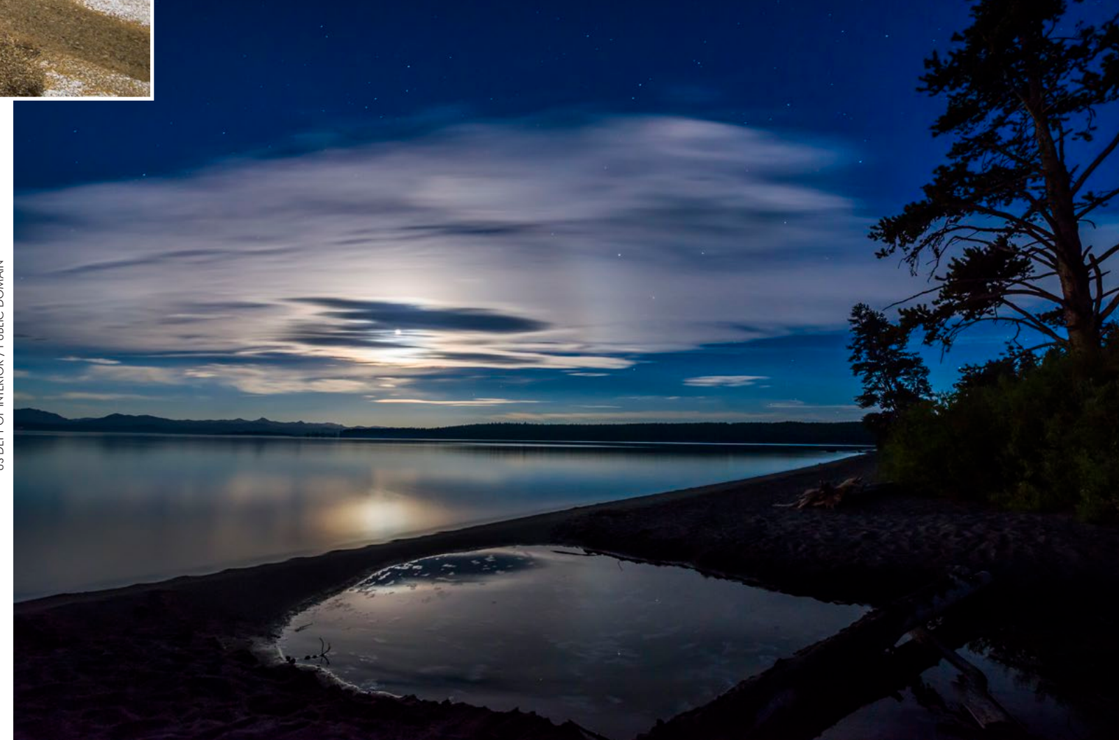
Yellowstone Lake (above) at night—it is the largest lake at high elevation in North America; Diver Trey Lessard (top right) enters the water at Bridge Bay in Yellowstone Lake; Location of Yellowstone National Park on US map (left)

Slow speed limits protect people and wildlife. Either may jump out from the forest at any moment. I booked my tent site at Bridge Bay Camparound, another hour from the south entrance. We headed west past the impressive Lewis Lake and then north along Yellowstone Lake, the largest lake at high