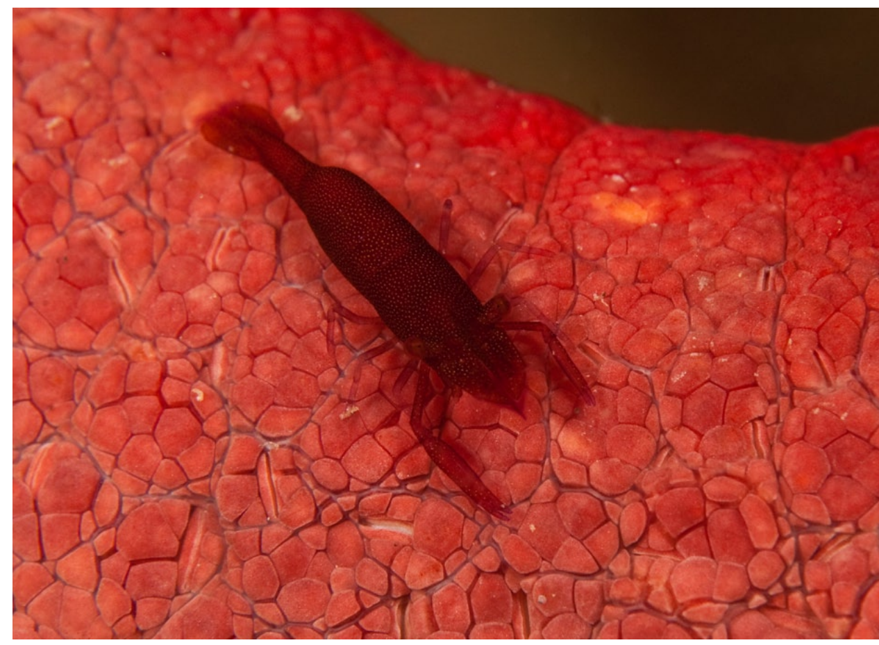
TOP LEFT TO RIGHT: Scorpionfish, hawkfish and mantis shrimp at the Pertamina Jetty and anemone shrimp at Dili Rock; Commensal Shrimp at the Pertamina Jetty (above); Hairy Crab at Dili Rock (left)

Currently the main diving locations in Timor Leste can be broken down into four areas: those in and around the capital of Dili; the coastal locations up to two hours' drive to the east and west of Dili; the large island of Atauro to the north of Dili; and