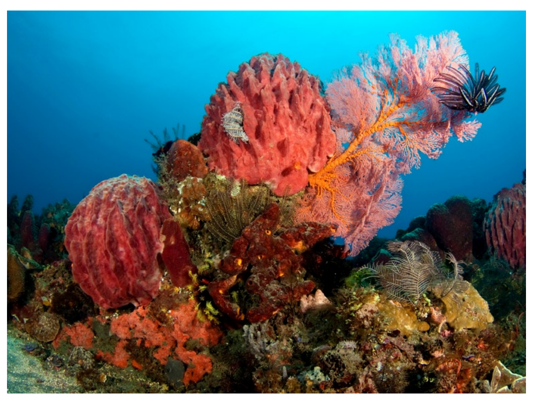
CLOCKWISE FROM TOP LEFT: Stunning bommie at Dirt Track east of Dili; Is this the best bommie in Timor Leste? Maubara west of Dili; Another incredible bommie at Maubara; Shy Goby on a sea whip at Bob's Rock east of Dili

At the very eastern tip of Timor is the area of Los Palo and the National Park of Jaco Island. Boasting brilliant white sand beaches, turquoise seas and apparently pristine reefs, the diving around the island is reputed to be exceptional, as the area is effectively completely unspoiled because the island is uninhabited and rarely visited by commercial fishing boats. But the only real option to dive Jaco Island is from a liveaboard, which simply was not available when I was there. But all that will change in 2012 when the highly regarded Worldwide Dive and Sail will conduct several back-to-back trips in Timor Leste with its liveaboard the SY Oriental Siren.