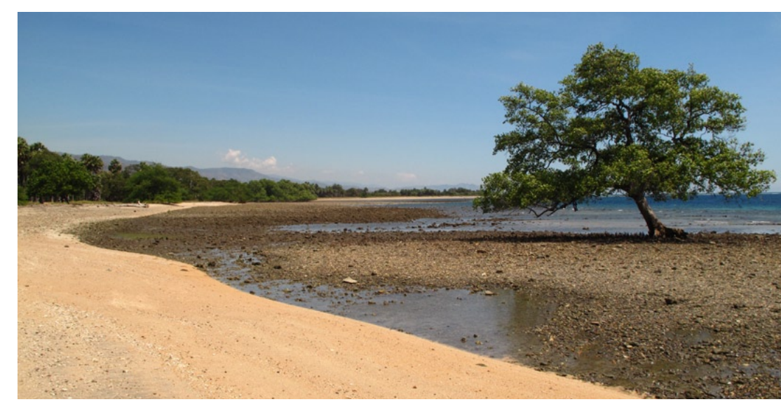
CLOCKWISE FROM TOP LEFT: Dive Timor Lorosae; Ata'uro Island; Mountains south of Dili; Dili sunrise; Secret Garden dive site; Coral Grouper