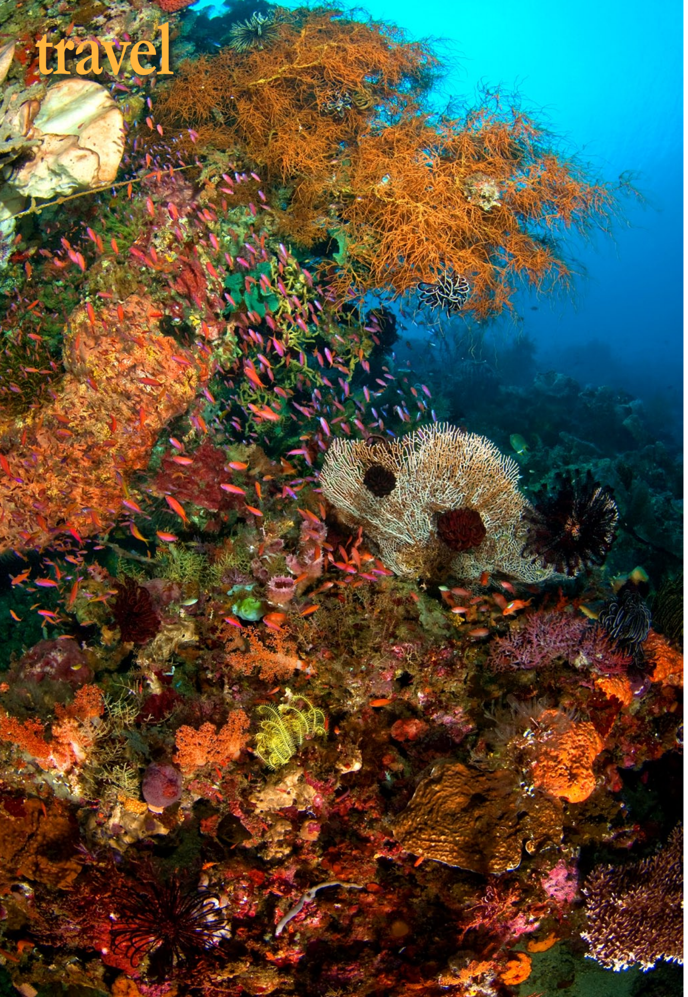
Schooling Anthias at Dirt Track east of Dili