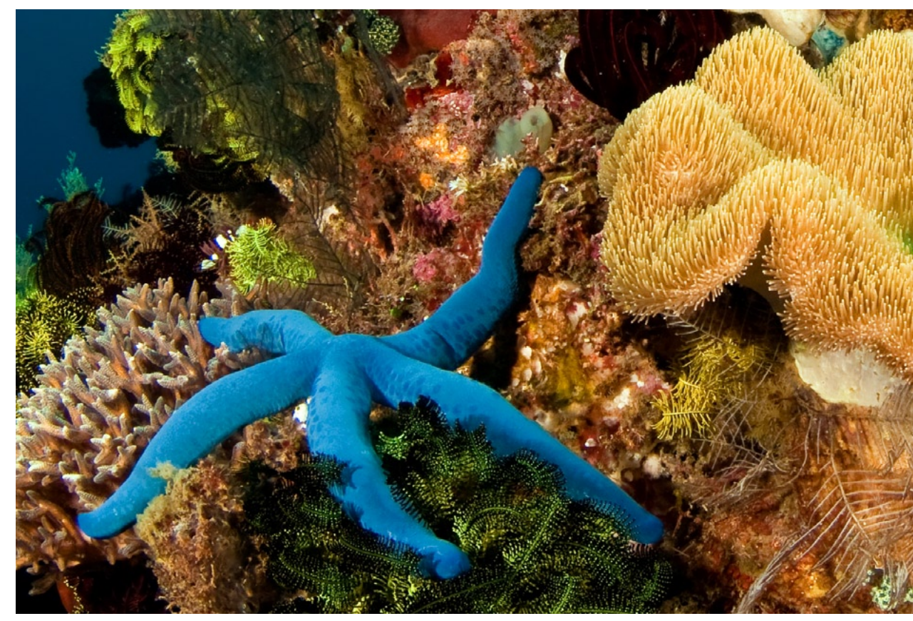
Sea Star at Dirt Track east of Dili

A very interesting facet of Timor Leste culture is tara bandu, a form of adat, or traditional customary practice. found among specific ethnic groups in Malaysia, Indonesia and the southern Philippines. In the absence of a formal law and order system, adats are used by these ethnic groups to regulate and control overall village life and its social order. During the occupation,