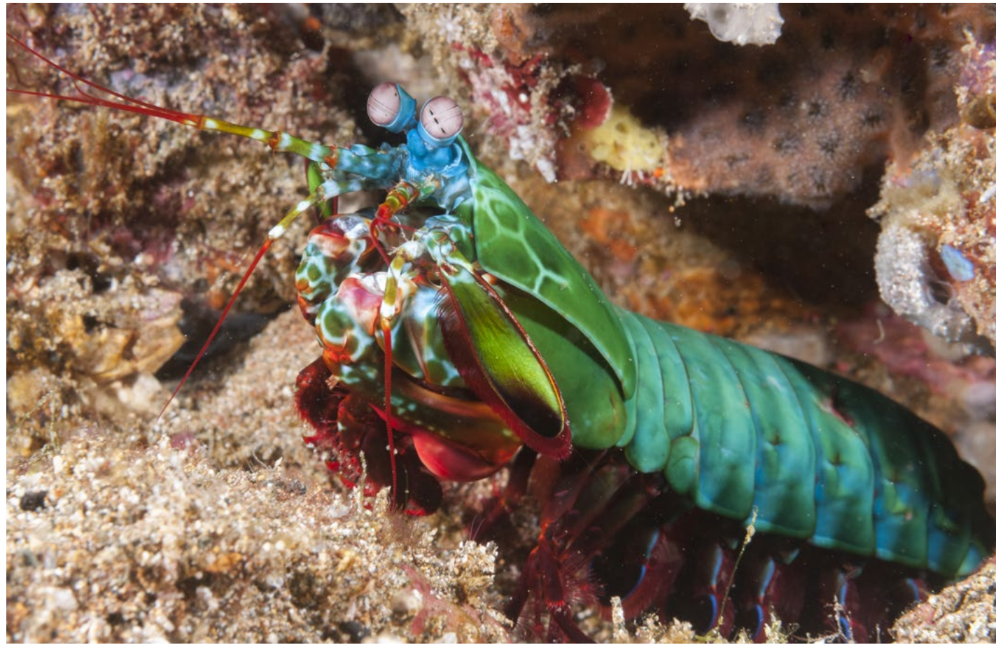
CLOCKWISE FROM TOP LEFT: Coleman's shrimp in fire urchin; School of bigeye, anthias, chromis and sweeper; Peacock mantis shrimp; Flatworm. PREVIOUS PAGE: School of anthias over coral garden