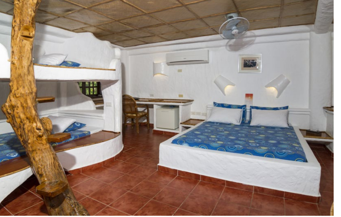
The Seaview Suite, or "Flintstone Room" (above); Restaurant view at Atlantis (top left)

Like a growing number of fullservice dive resorts in the region, Atlantis offers a full-service spa overlooking the pool opposite the restaurant. After 27-plus hours of travel and transfers, a 90-minute deep tissue massage was just the