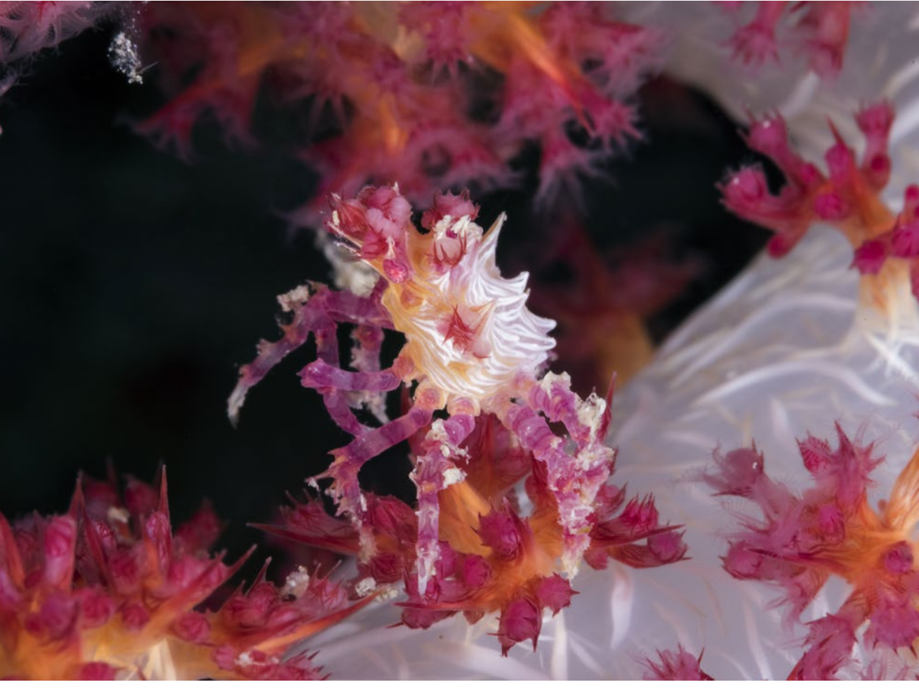
CLOCKWISE FROM TOP LEFT: Harlequin crab; Peacock mantis shrimp; Soft coral crab; Ornate ghost pipefish