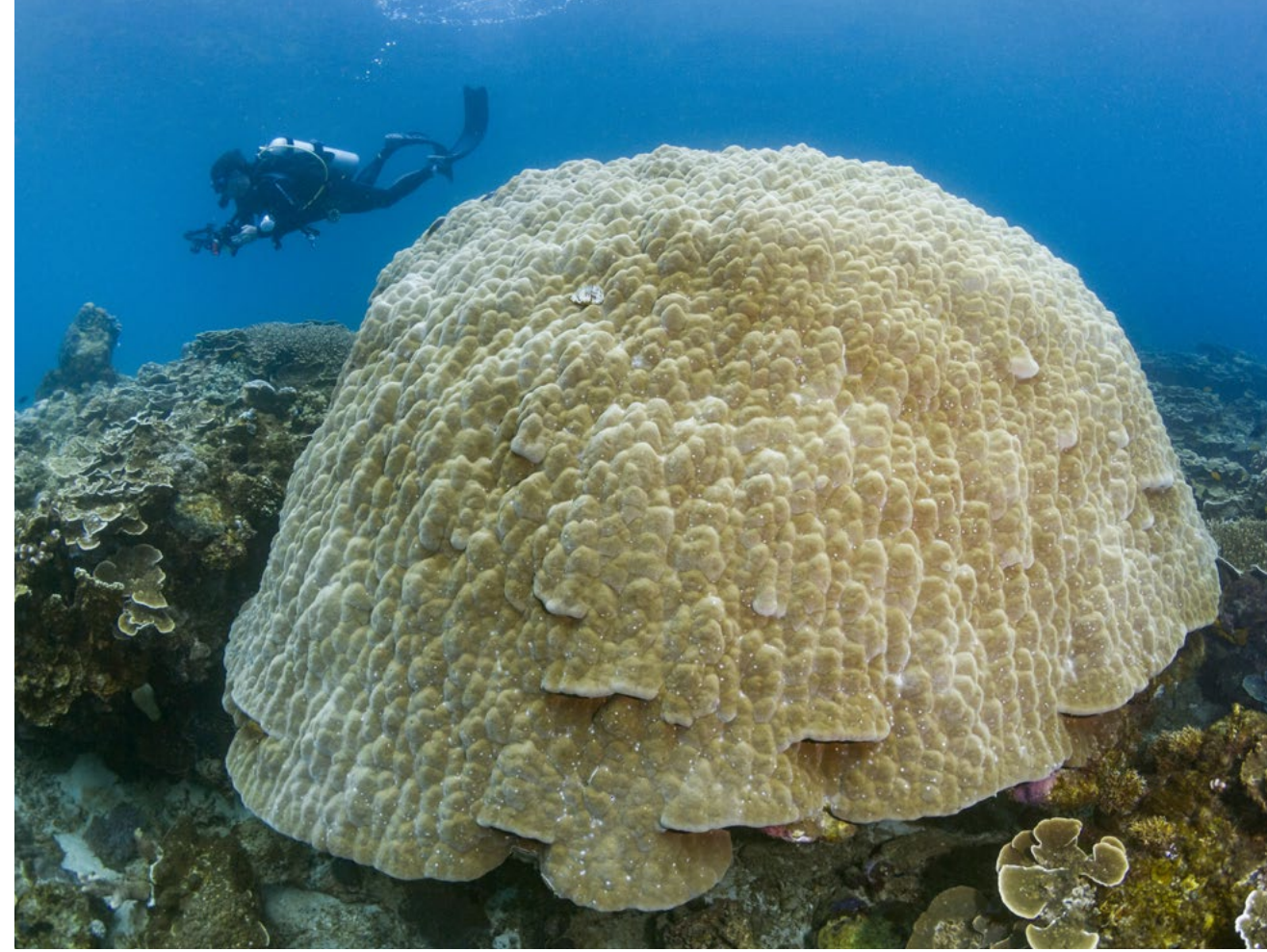
CLOCKWISE FROM TOP LEFT: School of anthias on reef covered in soft corals; Tiny cuttle-fish under crinoid; Diver and large dome of hard coral; Jorunna funebris nudibranch

The daily dive schedule usually involves a series of single dives set around 8 to 9 a.m., 11 a.m., 2 p.m. and 4 p.m., with trips back to the resort after each to change out the tanks. This is because the majority of the diving in the Puerto Galera/Sabang Beach area is no farther than a 20-minute ride from Atlantis'