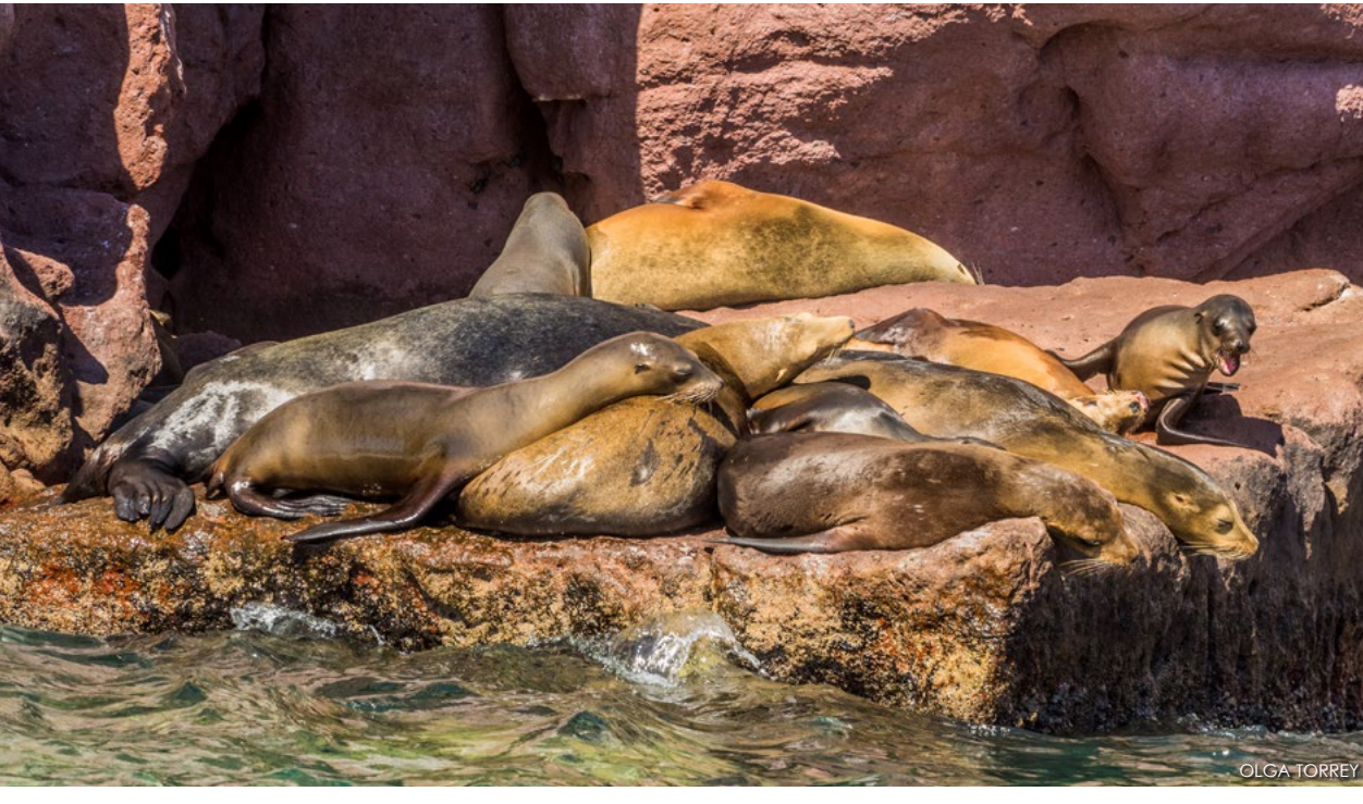
male sea lion standing guard (left)