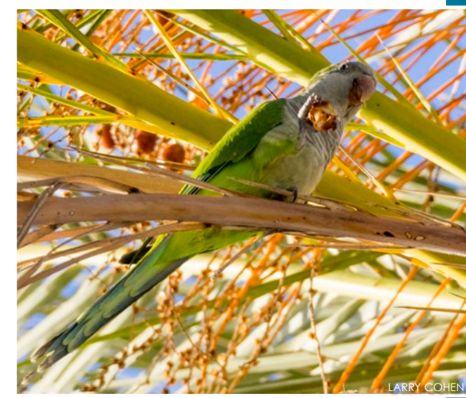
Wild parakeet enjoying a date

The waters off La Paz are nutrient-rich with plankton, so visibility is low. Just 15 min-