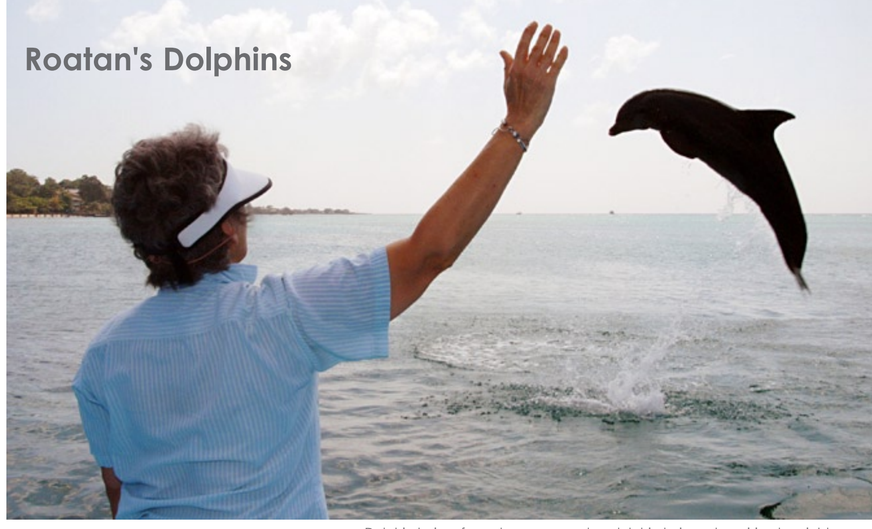
Dolphin trainer for a day commands a dolphin to jump by raising her right arm.

vou head back to the fish house to prepare another meal. Then it's time to learn the hand signals trainers use to communicate with the dolphins.