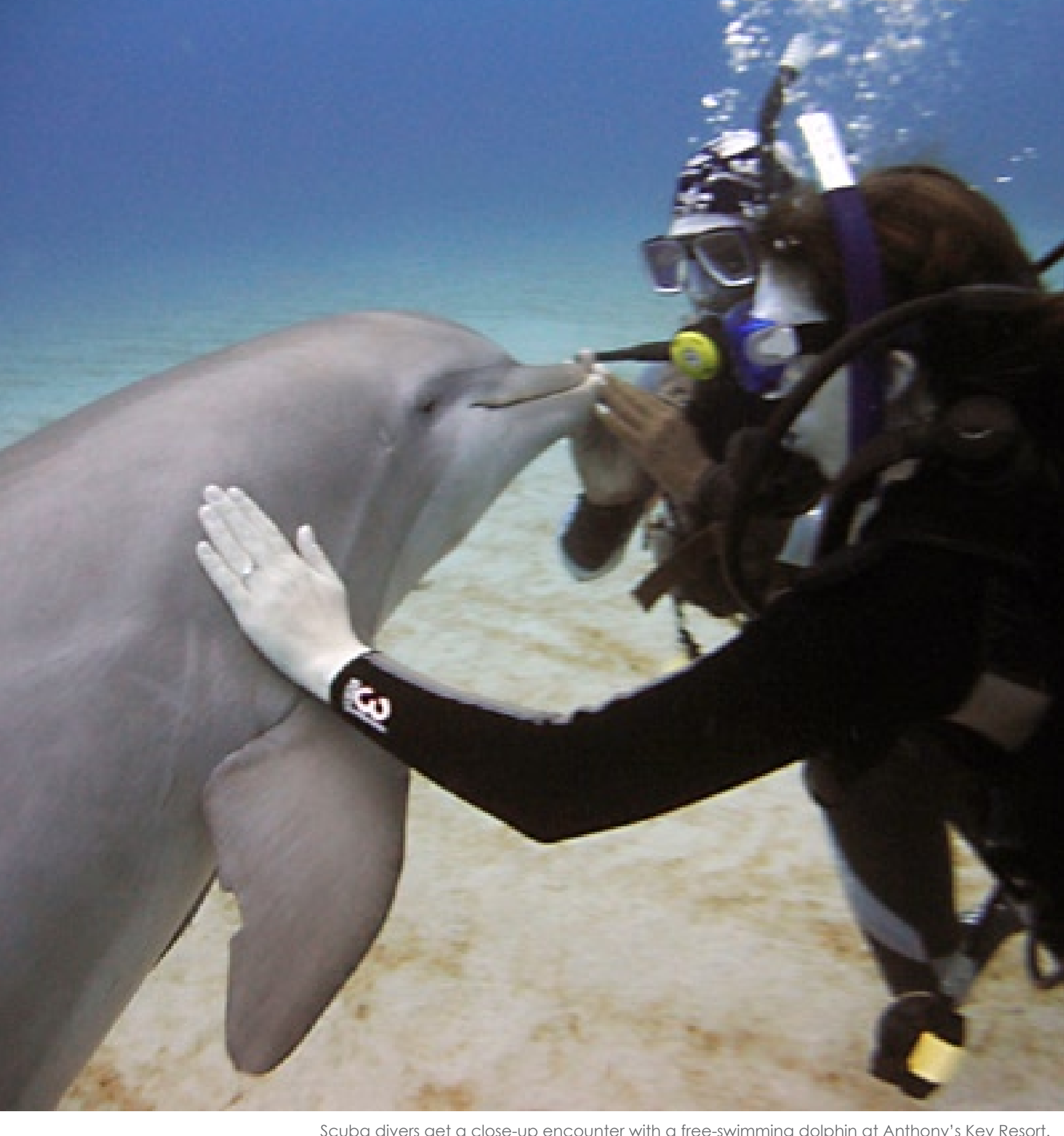
Scuba divers get a close-up encounter with a free-swimming dolphin at Anthony's Key Resort.

For more information about Anthony's Key, go to www.anthonyskey.com or call (800) 227-3483. ■