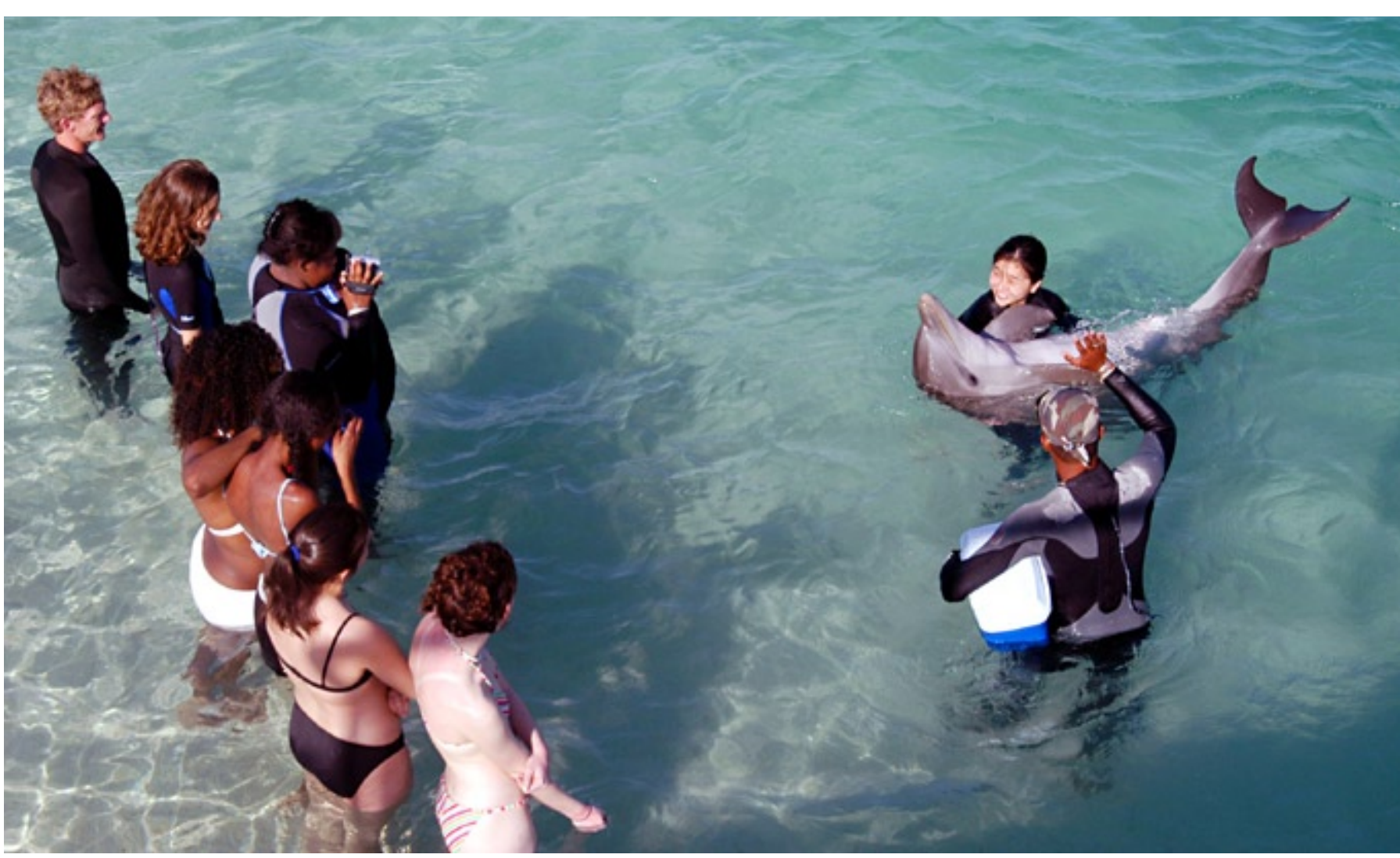
LEFT & RIGHT BOTTOM: Swimmers get a close-up encounter with a dolphin at Anthony's Key Resort.

After watching the trainers interact with the dolphins and learning about their habits and likes and dislikes