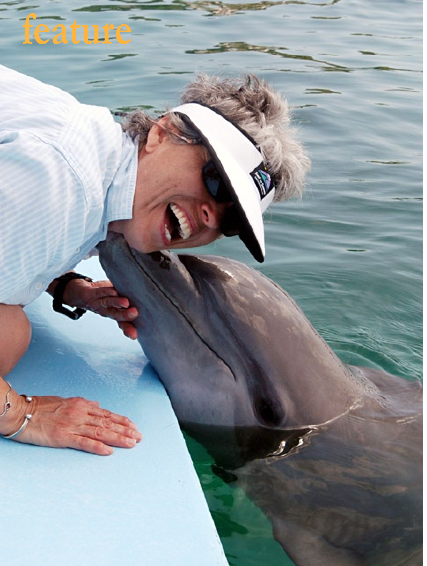
Dolphin trainer for a day gets a kiss from a dolphin.