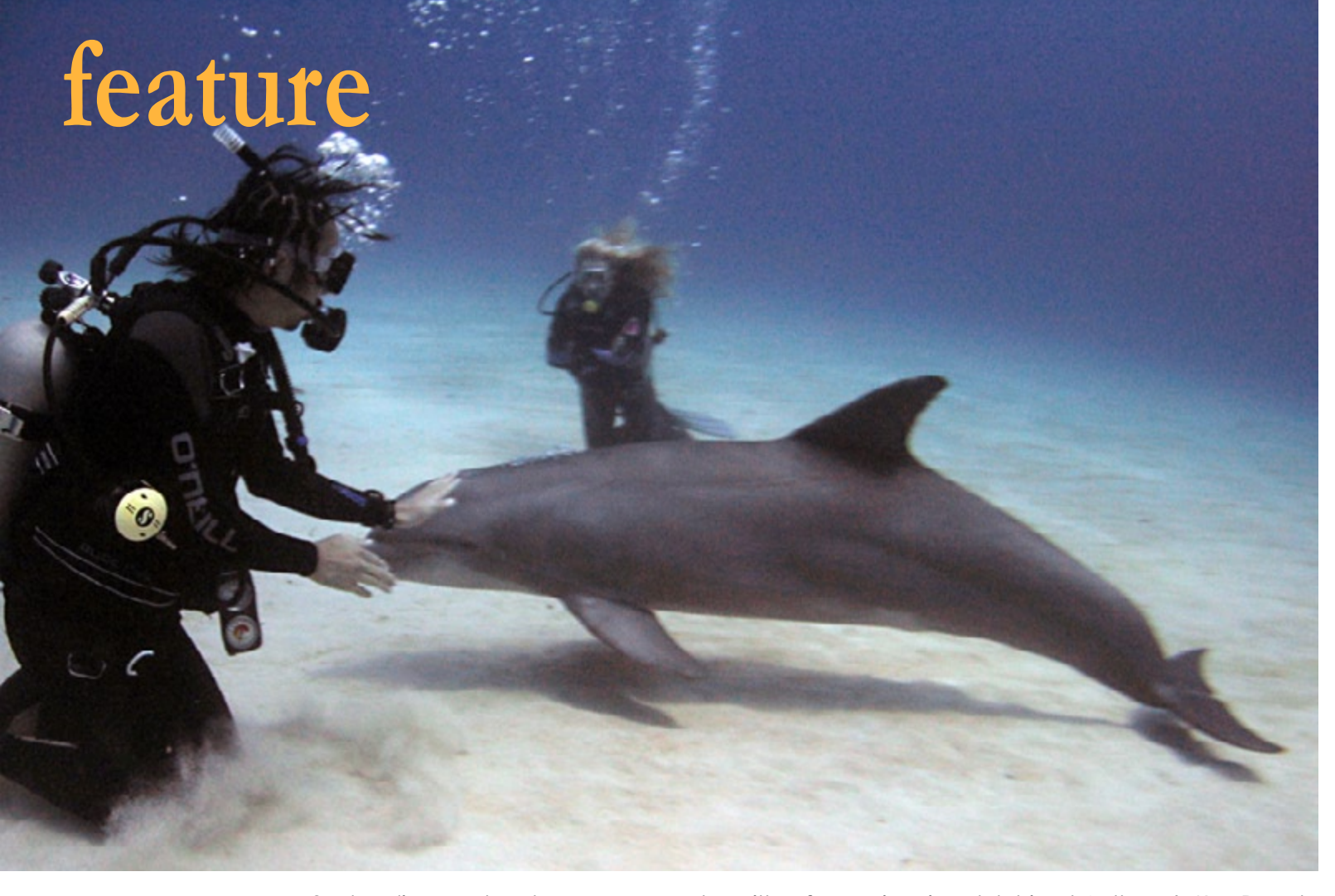
Scuba divers get a close-up encounter with a free-swimming dolphin at Anthony's Key Resort.