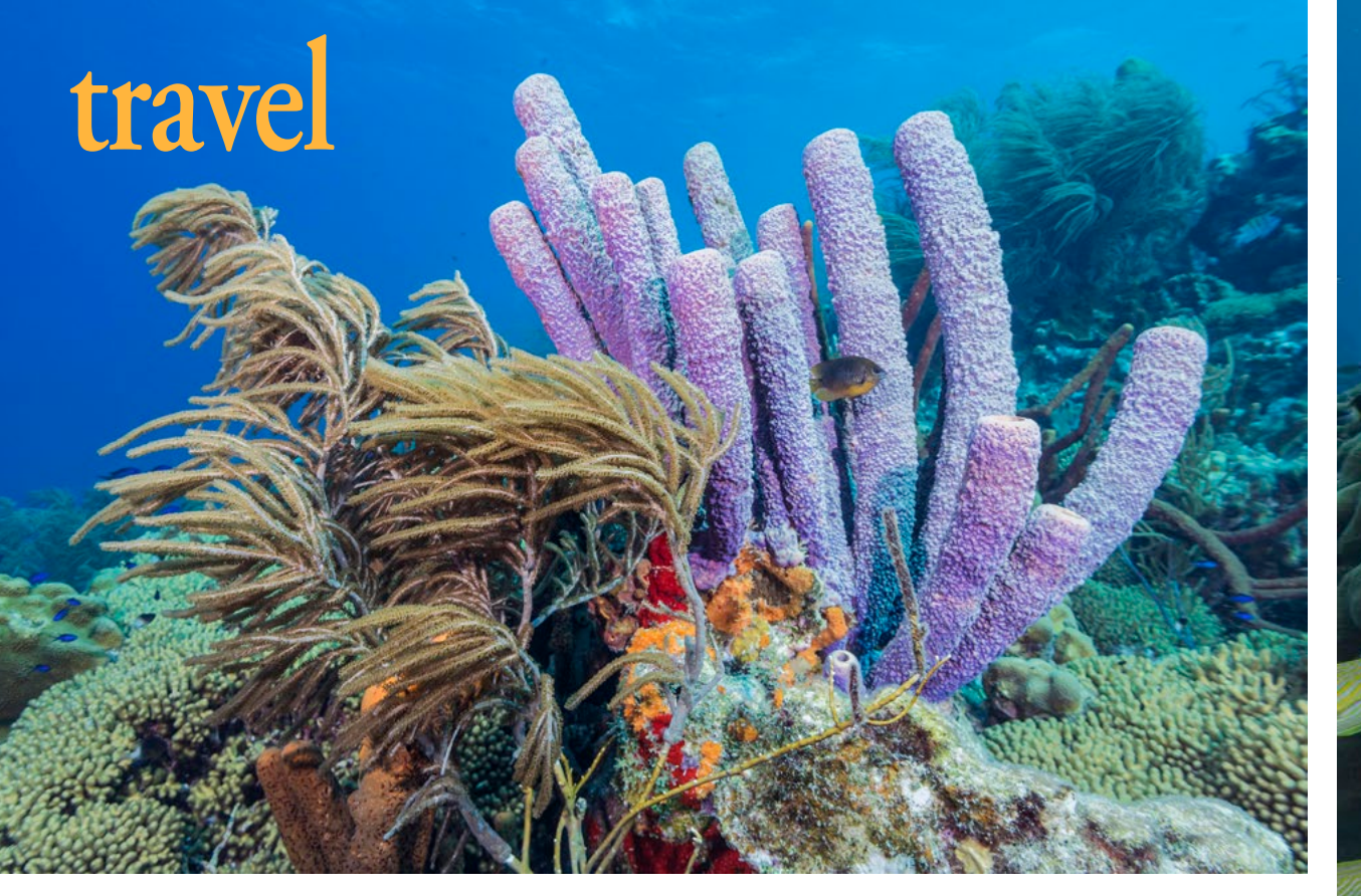
CLOCKWISE: Threespot damselfish swimming amongst a large colony of purple tube sponges and sea rods; School of lane snappers and smallmouth grunts swimming above colonies of star corals; Numerous venus sea fans extending from the shallow coral reef; Diver inspects azure vase sponge; Spotted porcupine fish peers into the camera.

and, on this dive, personally witnessed southern stingrays and scorpionfish hiding in the sand, along with a green sea turtle munching on sponges towards the end of our dive.