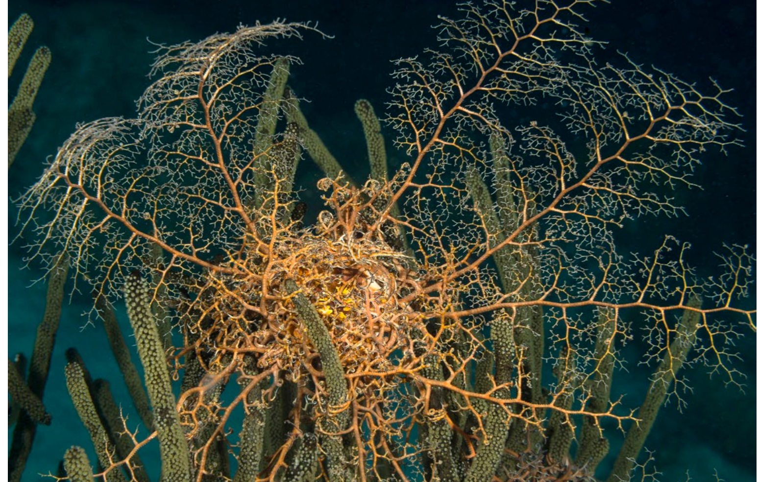
Caribbean basket star opens up its branches at night to collect food (above).