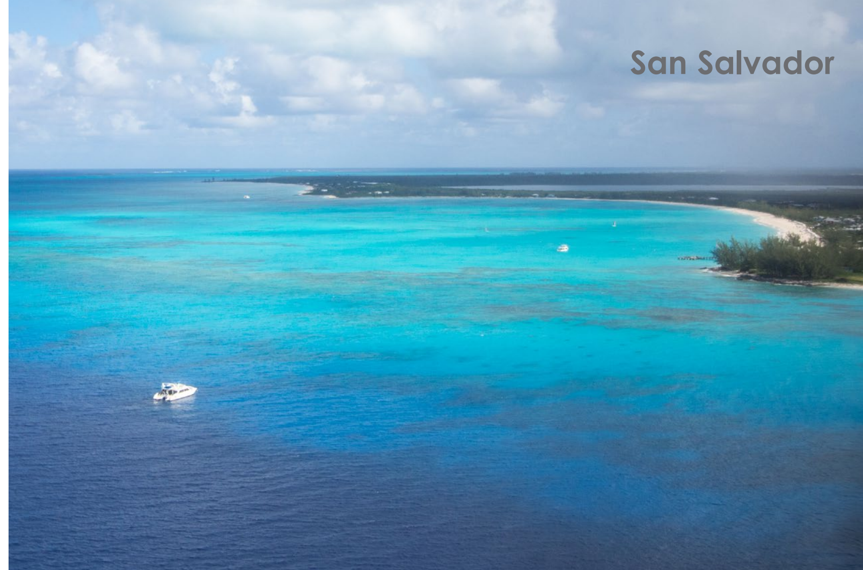
The beautiful blues of the west coast dive sites of San Salvador Island

A 50-minute flight southeast from the bustle, cruise ships and tourist-centric capital city of Nassau in the Bahamas, lies the sleepy island of San Salvador. Twelve miles long and five miles wide, she is the tip of an underwater mountain rising from 5,000 metres below (15,000 feet) surrounded by picture-postcard, crystal-clear, blue seas.