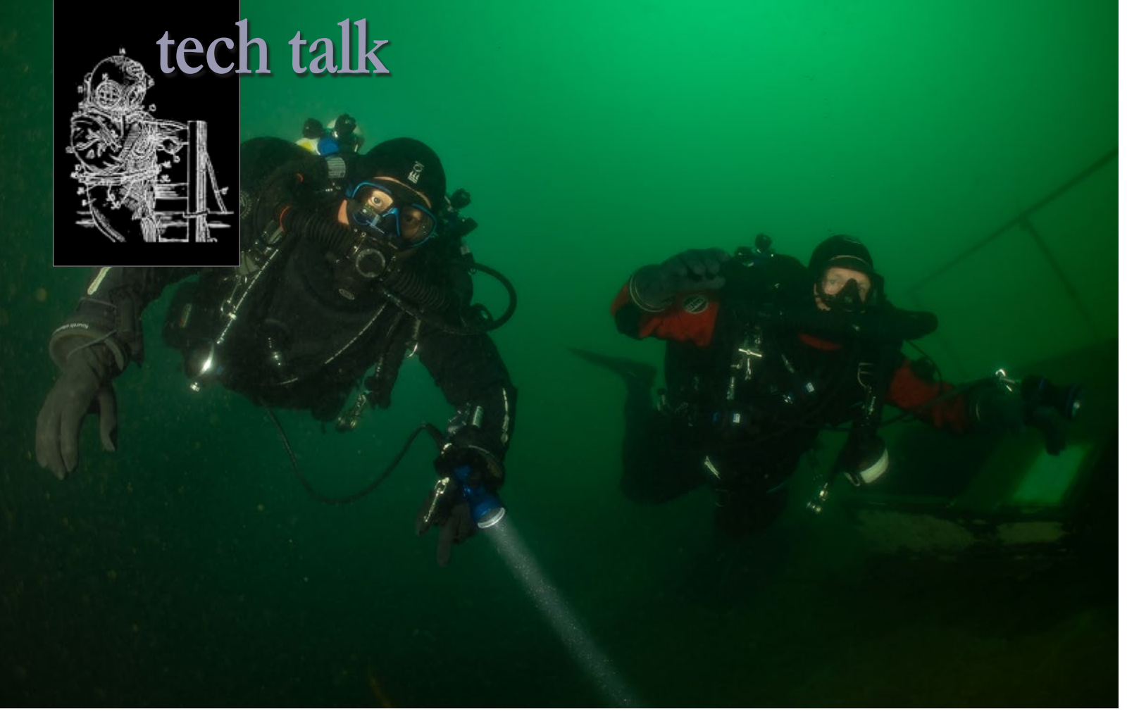
The last course day focused on in-water rescue techniques, ending with a final exam, swim tests and a "fun" dive.