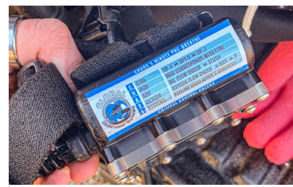
Checklist for GUE CHAOS five-minute pre-breathe protocol