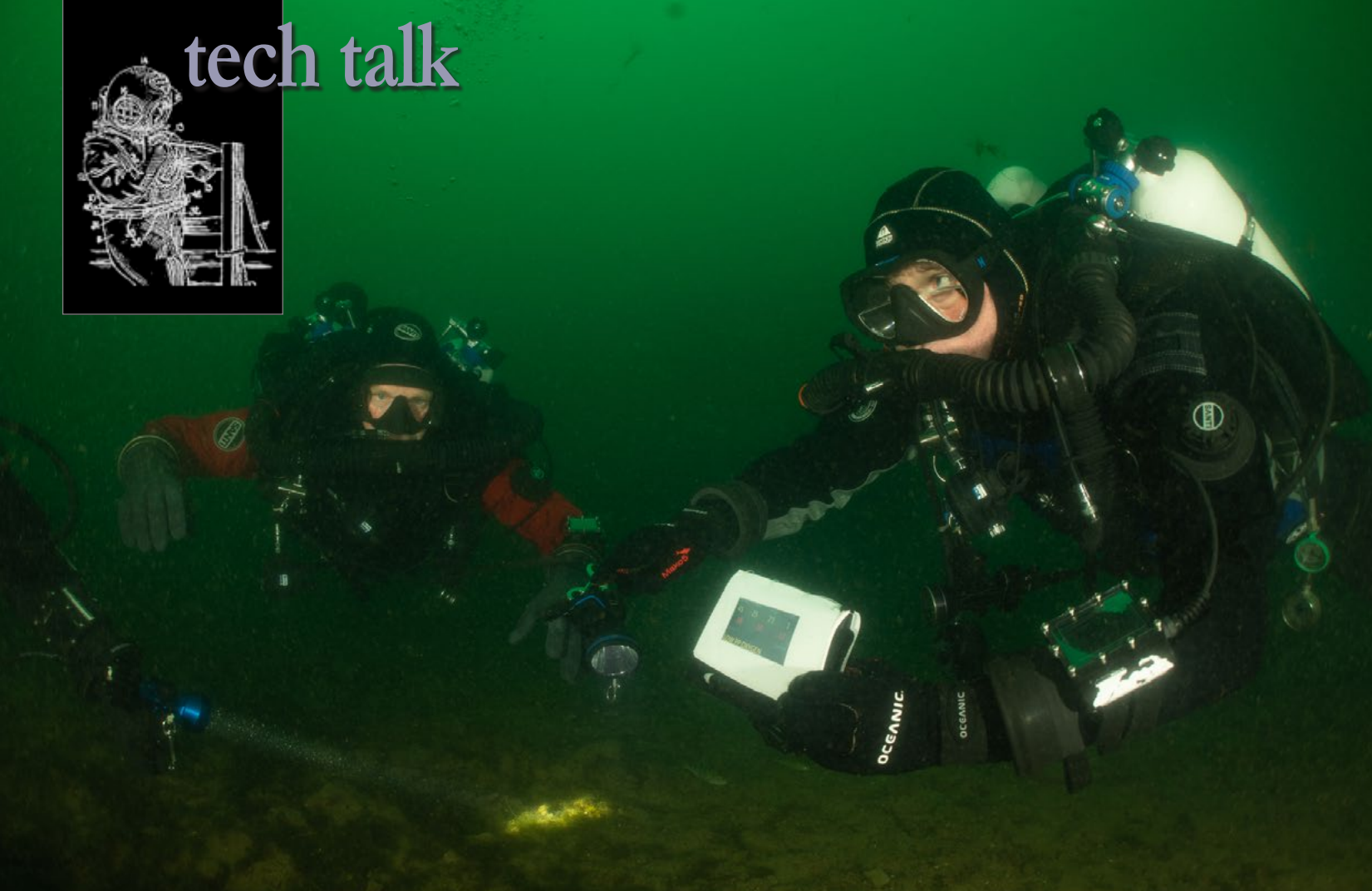
The fourth course day focused on "failure cards," to which the team had to respond for various failure scenarios shown.