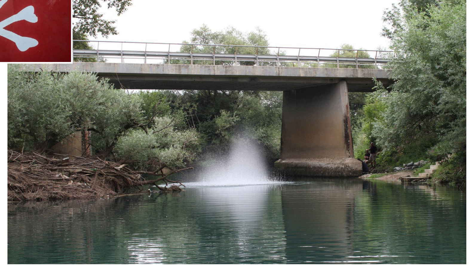
Disposal by detonation of an unexploded hand grenade found in the Klokot creek near Bihač (above); Dangerous ammunition found at the bottom of a Bosnian river (left); Divers use buoys to mark the search sectors (top left); This is how dangerous places are marked in Bosnia (center inset)

You can hardly see in the mud and you are constantly drawn by the current. The danger is hidden in the sediments—one careless move is all it takes. "When you