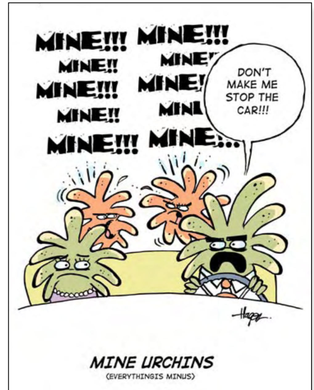
MINE URCHINS (EVERYTHING IS MINUS)