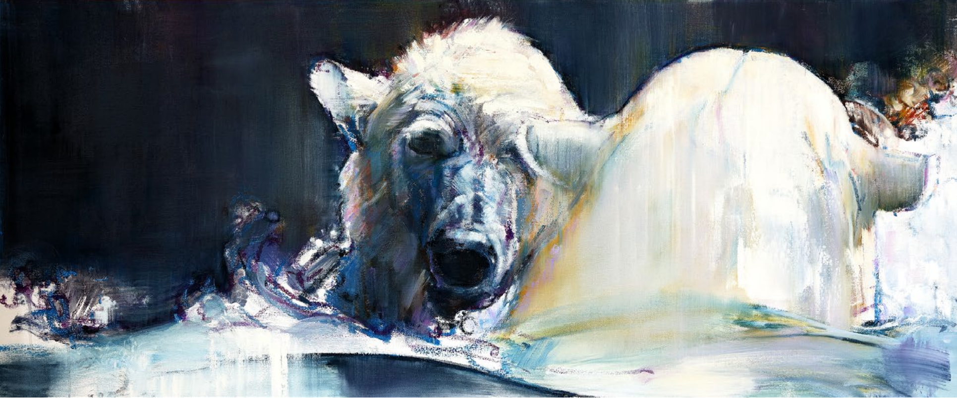
Wave, oil on canvas, 50 x 100cm (above), and Swimming Cub, mixed media on paper, 31 x 31cm (upper right), by Mark Adlington

X-RAY MAG: 93: 2019 EQUIPMENT EDITORIAL FEATURES TRAVEL NEWS WRECKS BOOKS SCIENCE & ECOLOGY TECH EDUCATION PROFILES PHOTO & VIDEO PORTFOLIO