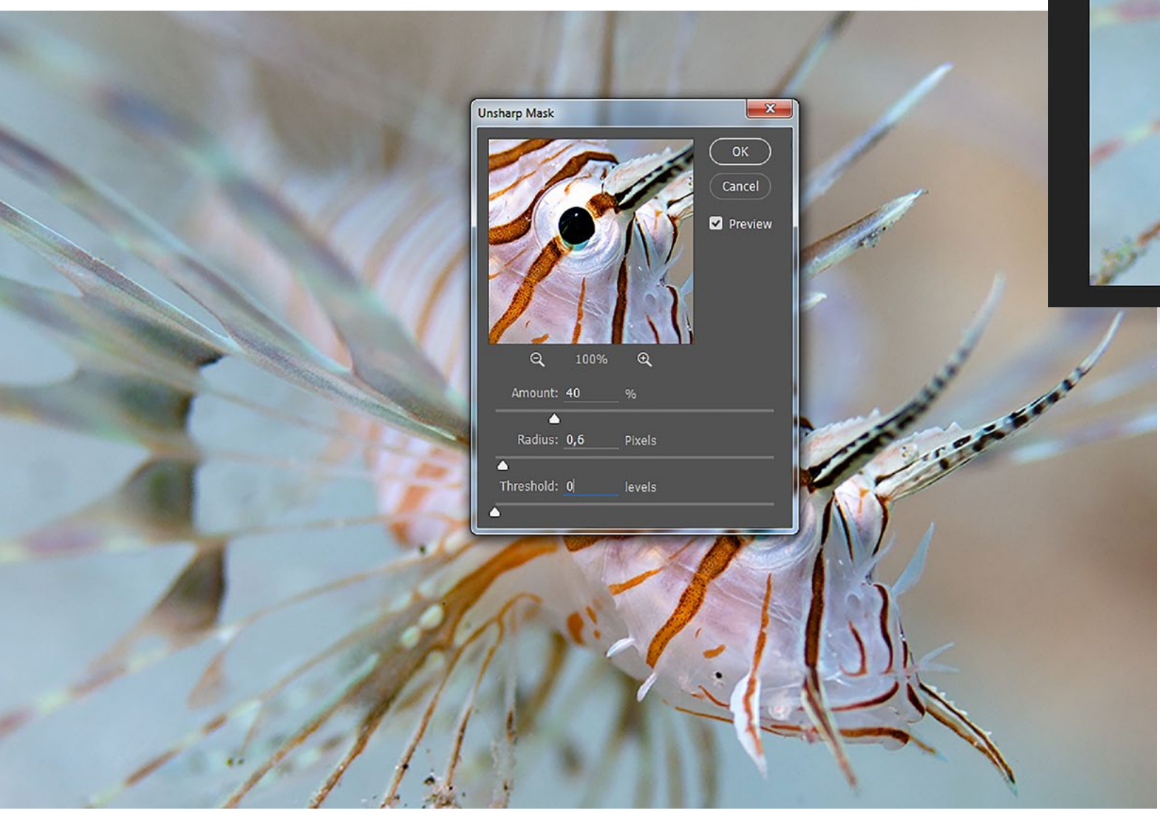
Screenshot 5. To equalize the sharpness loss due to re-sizing, use the Unsharp Mask panel to slightly adjust the sharpness of the image file. Set the "Amount" between 25 and 40, with a "Radius" of 0.5 to 0.7 and a "Threshold" of "0".

the changes?" you select, "NO"! Otherwise, you would overwrite your full-size original Photoshop file with a downsized one.