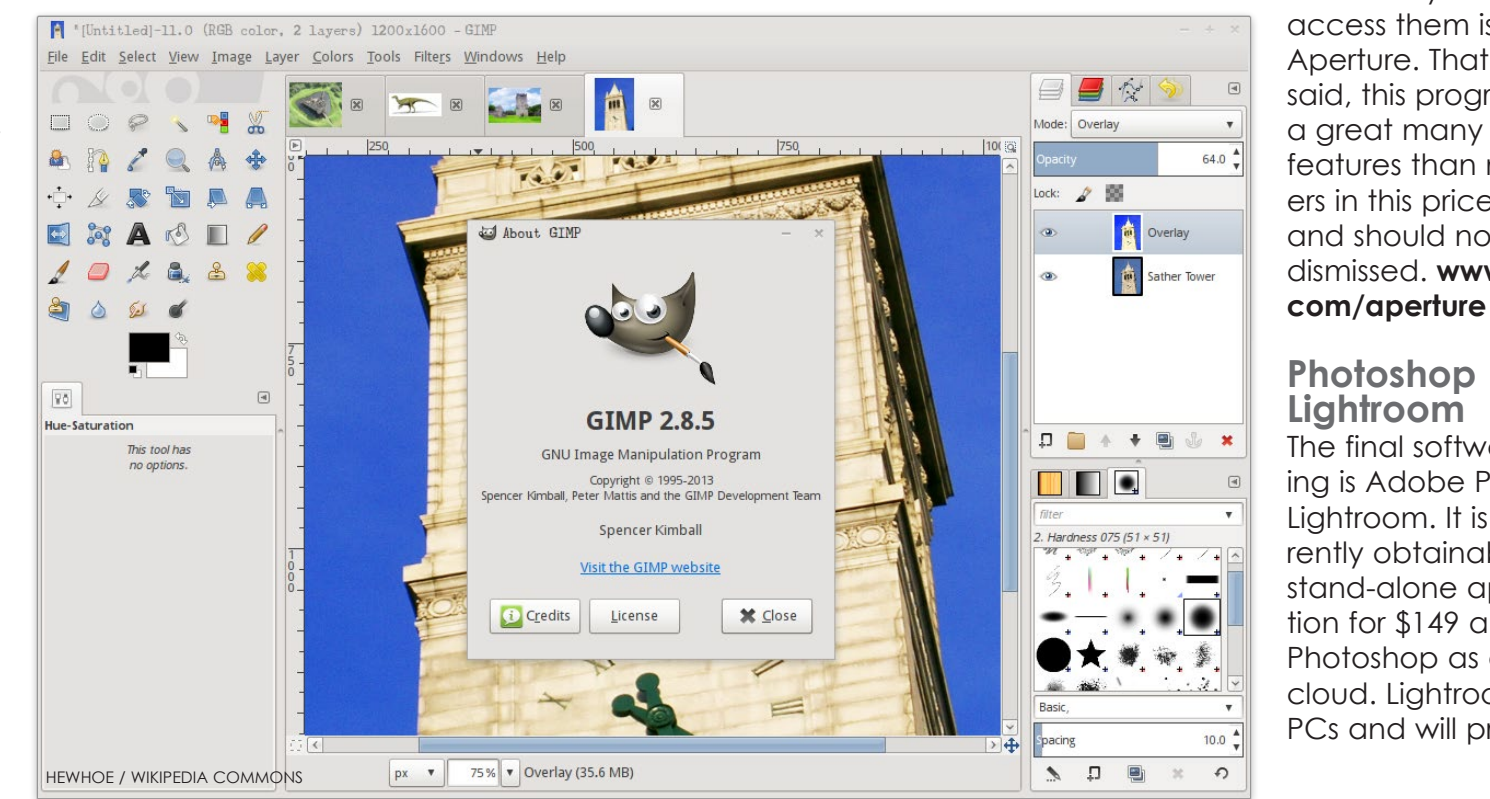
Gimp running on Linux system