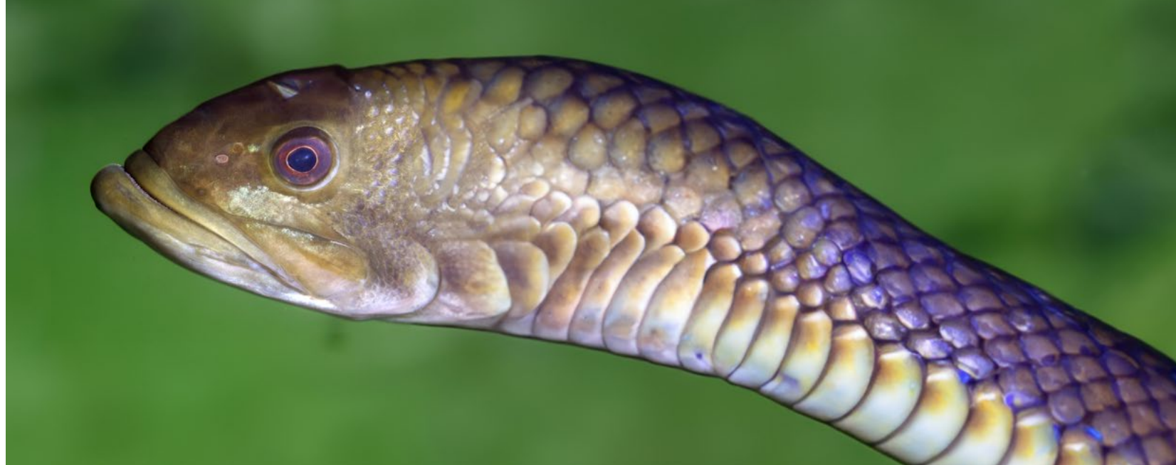
Image 14 (bottom left): Original "meh" photo of a fish; Image 15 (left): Image 14 modified with GAI, with "snake" in the prompt, creating a fantasy creature.