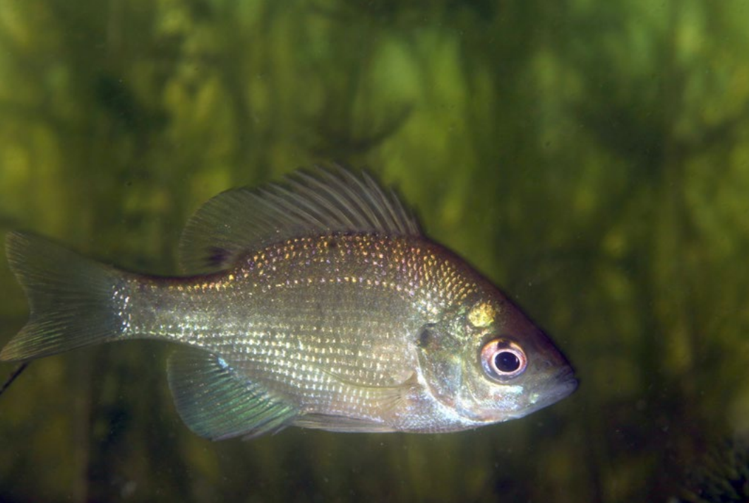
Image 1 (above): Lake fish. Gear: Canon EOS 7D Mark Il camera, Tamron 60 mm macro lens, Nauticam hous-