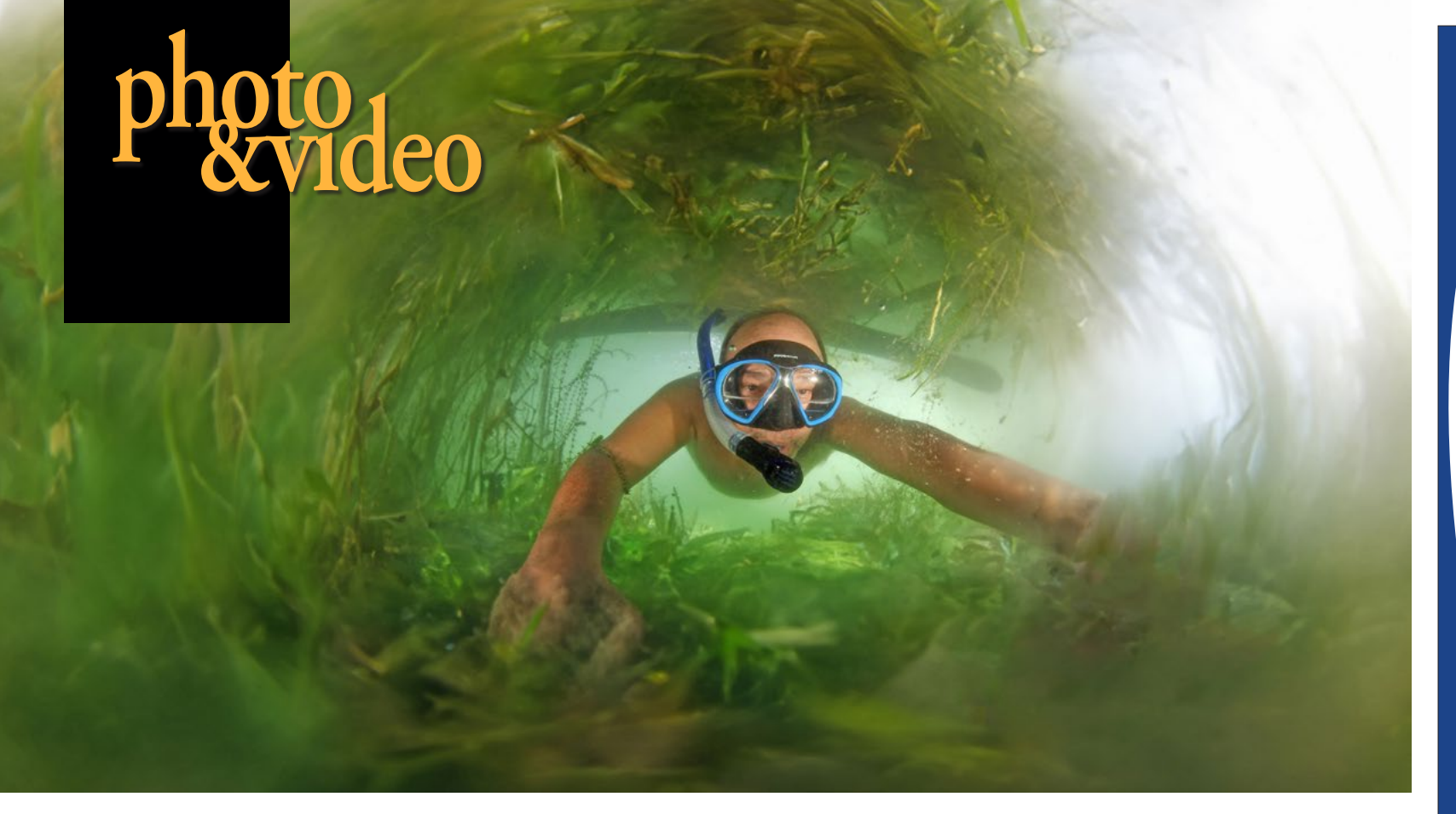
Image 9 (right): The author snorkeling in a lake. Video frame grab. Gear: Canon EOS 7D Mark II camera, Tokina 10-17mm fisheye lens (at 10mm), Nauticam housing, dual Fix Neo 4030 DXII video lights; Image 10 (above): Image 9 modified with GAI

and a sharp subject. This image was downsized for online use, but the large files are great for big prints.