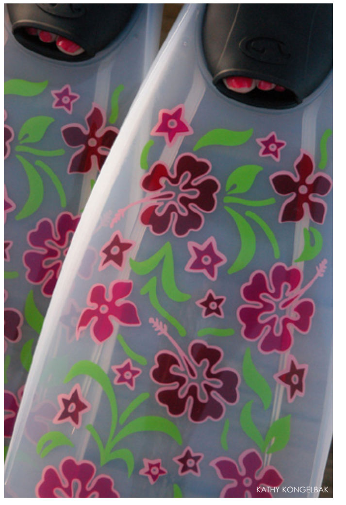
Funky Fins—fun fins with creative imagination

Coming into the pool, however, are women who want to make diving easier for other