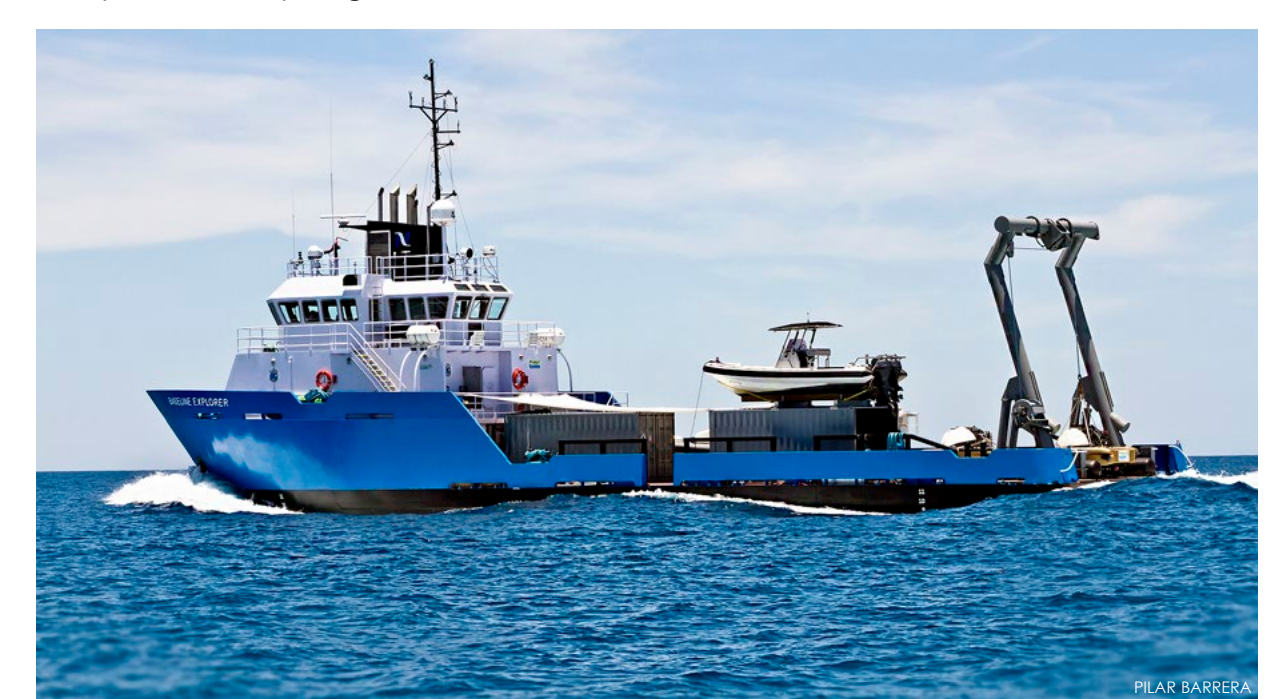
The Baseline Explorer transports her crew, divers and all the equipment required to complete remote operations at sea to the next mission location in the Atlantic Ocean

When volunteer divers are coupled with scientists and resource managers struggling to understand and protect the ecosystems where communities of divers are present, the collective effort becomes greater than the sum of its parts.