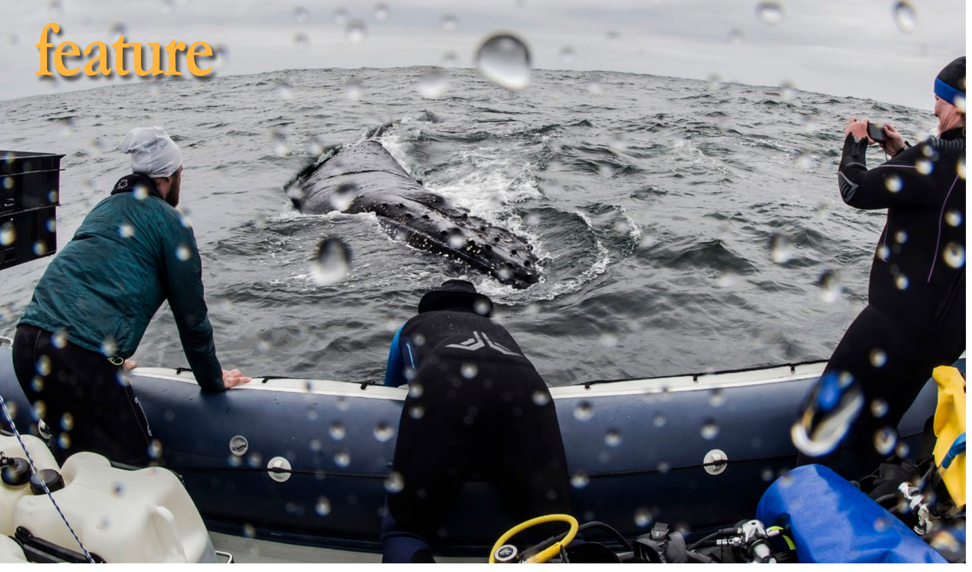
A curious, young humpback whale checks out the boat and greets the divers

even closer to us, and the animals began what is known as "spy-hopping," i.e. with the tip of their heads coming straight out of the water, their brought their eyes partly over the water's surface, behind and beside our boat. It was a unique spectacle, seeing these smart and very curious animals spy-hop, which kept us in an excellent mood for over an hour.