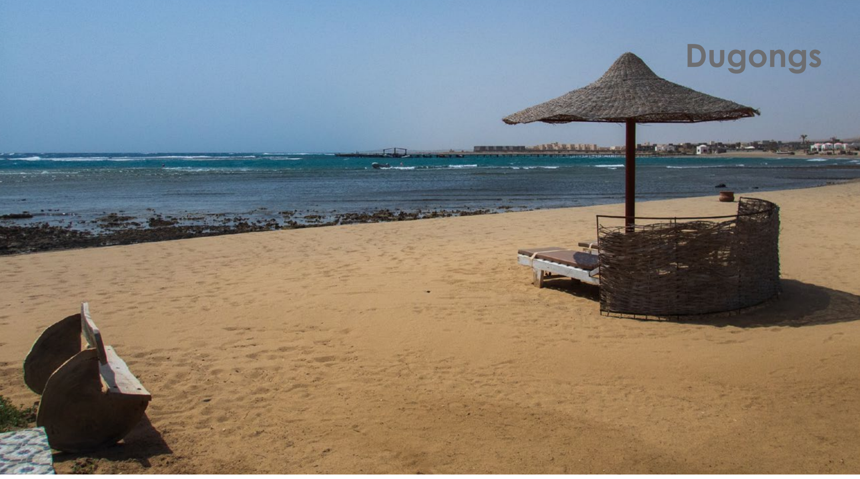
The friendly staff who looked after us at the dive centre (left); The beach at Marsa Alam, with our zodiac waiting for us close to shore (above); The dive centre's lovely cool and shady kitting-up area (lower left)