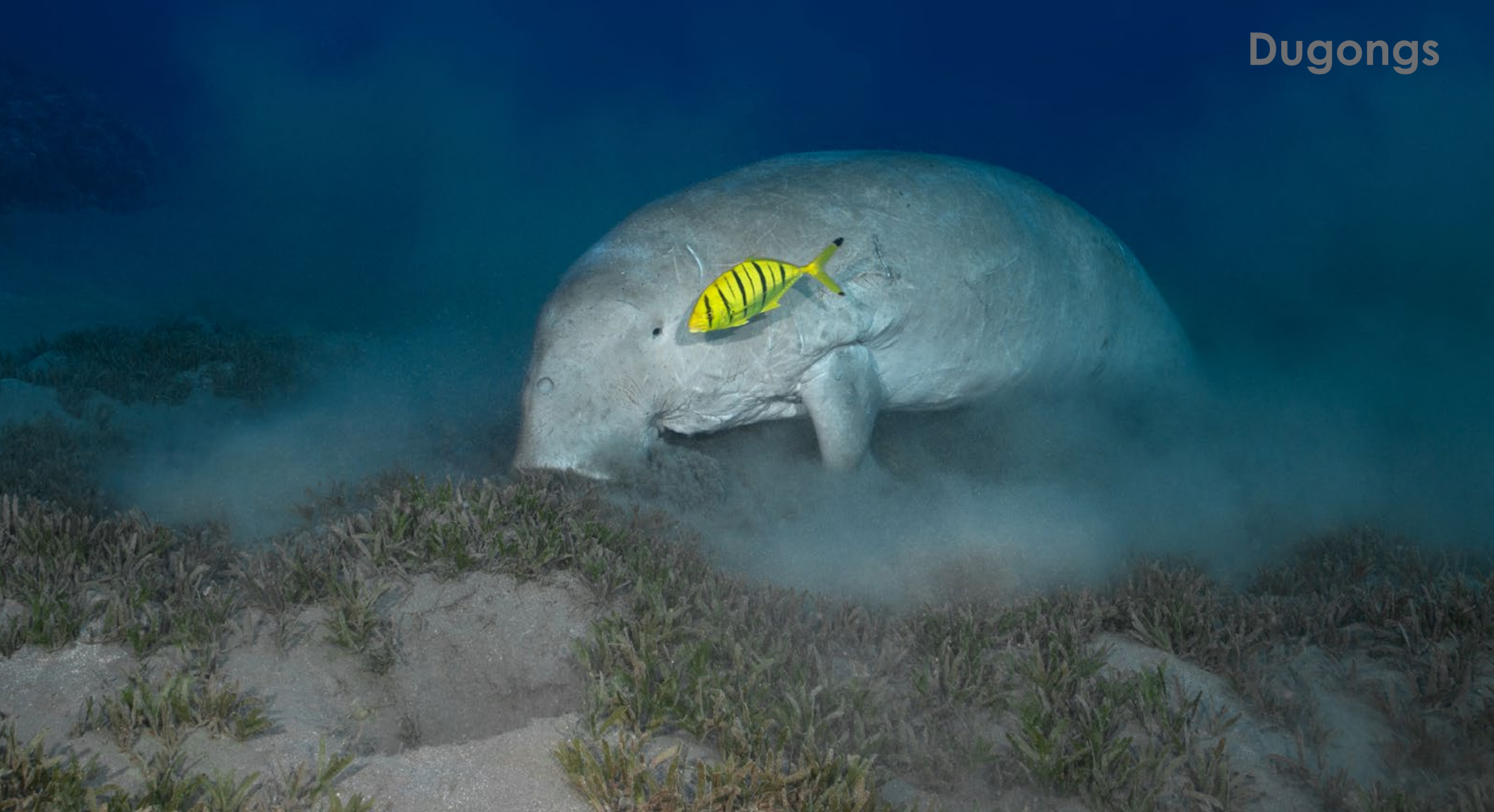
The dugong settles in and starts enjoying a meal of sea grass (lower left); After taking a breath at the surface, the dugong soon returns to feed with its entourage of golden kingfish (left); Always a golden kingfish is close by to pick up the spoils left behind by the dugong (above). PREVIOUS PAGE: Our dive guide Bassem patiently watches over me as I take my time photographing the dugong.