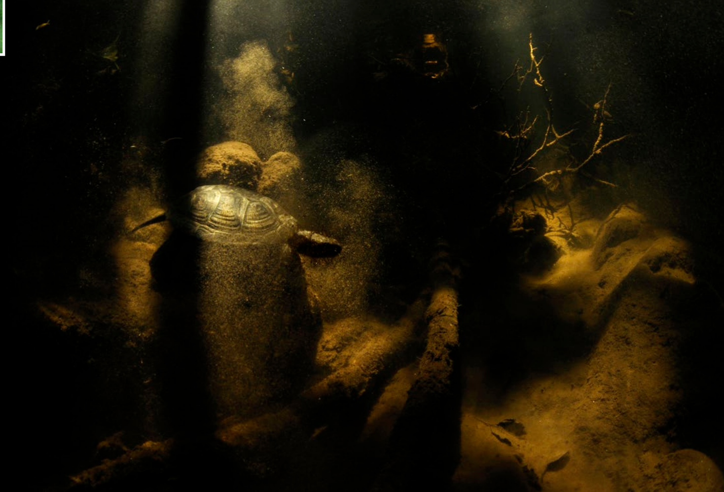
Pond turtle, Emys orbicularis (above), are shy creatures, which find small animals to eat at the bottom of rivers.

Olm. Another amphibian that lives in underground lakes and rivers in