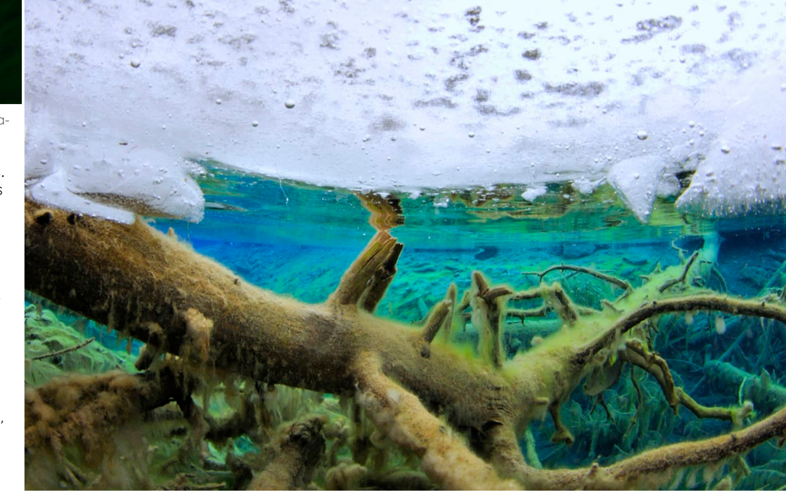
From mountains to caves, freshwater environments and creatures can be found in Italy's ponds, lakes, rivers and stream

Diverse aquatic life From mountain peaks to caves, every corner of Italy offers surprises to the prepared naturalist and photographer. The important thing is to study the