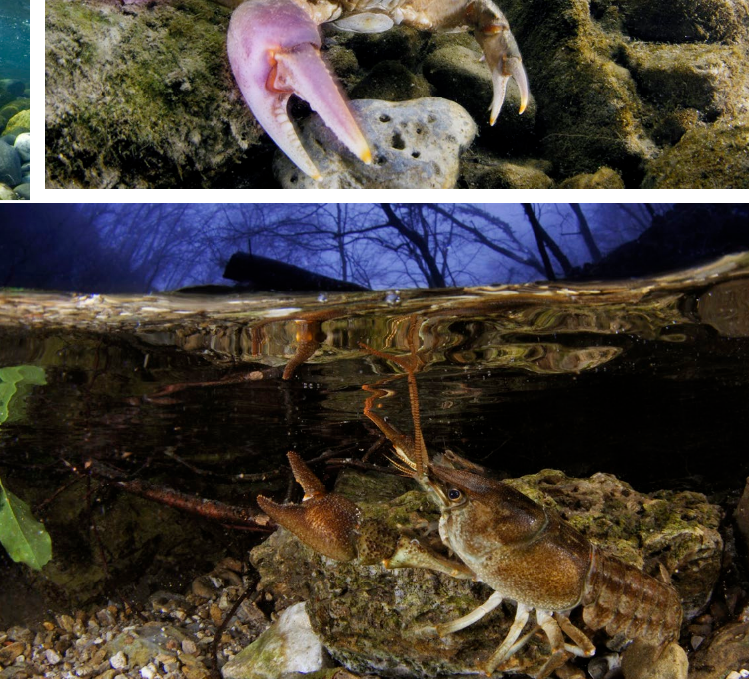
Crayfish live in clear streams in the hills and mountains (above); River crabs can be found in streams in the central and southern regions of Italy's peninsula (top right).