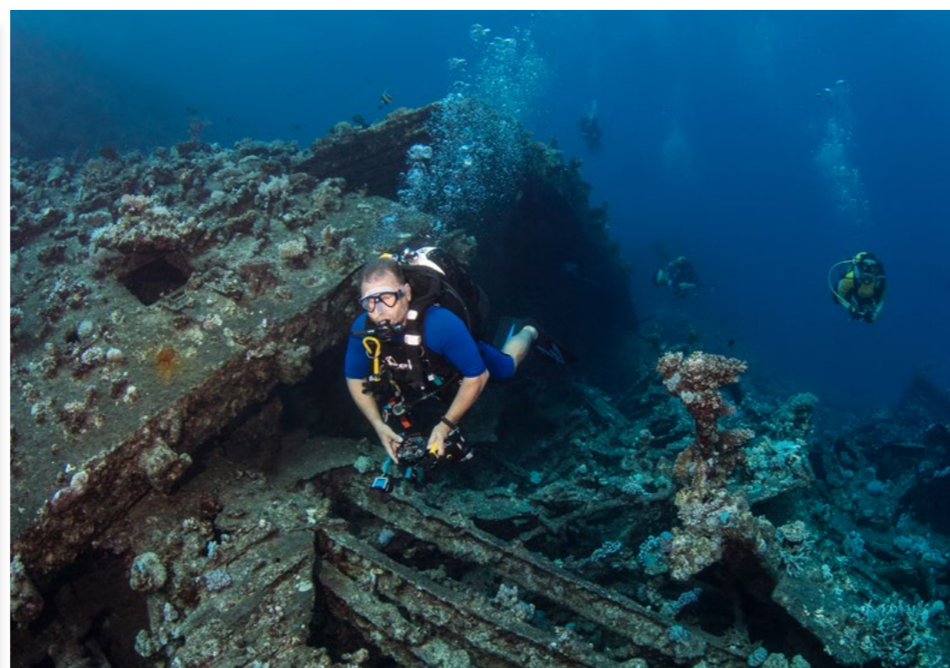
Divers exploring wrecks adds human interest to the image (above); Have your diver look at the item of interest (right); Adding divers to big-reef images adds a sense of scale (top right).