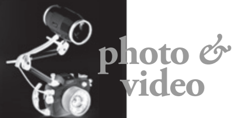
photo & video