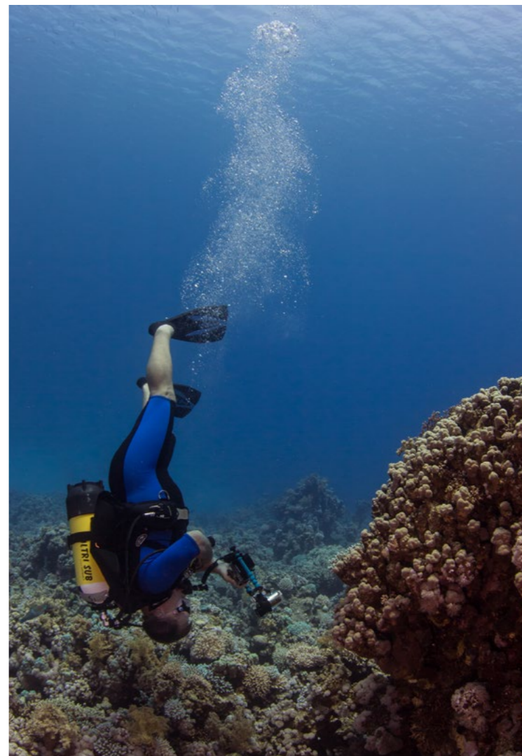
Some buddies can add a touch of humour to your photos.

man nature to want to see the eyes, and a fogged-up mask is distracting, looks unprofessional and simply ruins the shot. Similarly, make sure your models do not have too much water lying in the bottom of their masks.