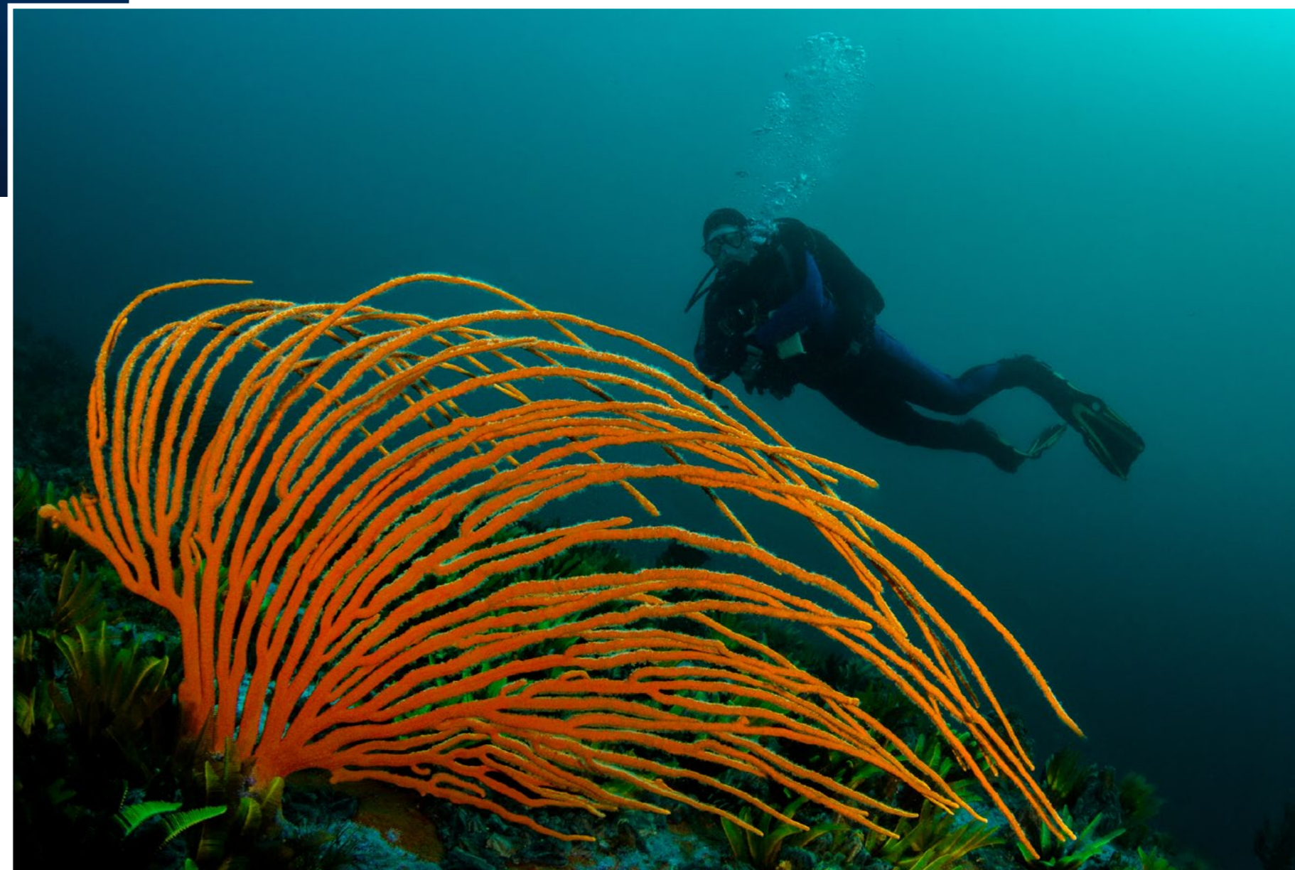
Light up the foreground and have your diver in silhouette behind (above); Fellow photographers often make great models (top left); Divers add a sense of adventure to a photo (left).