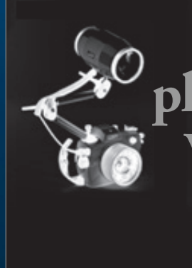
photo & video