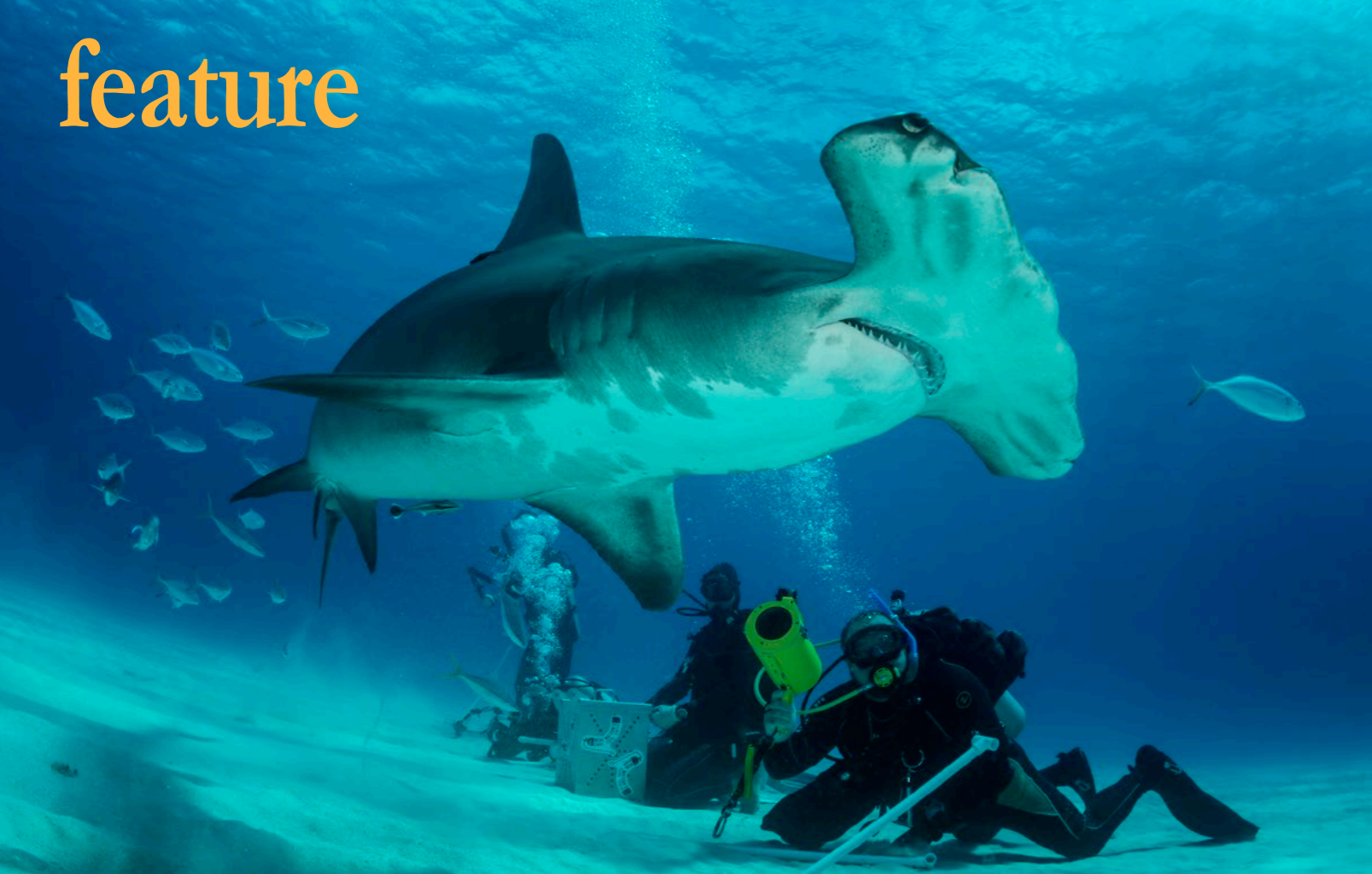
Great hammerhead shark exits the feeding area on day dive (left)