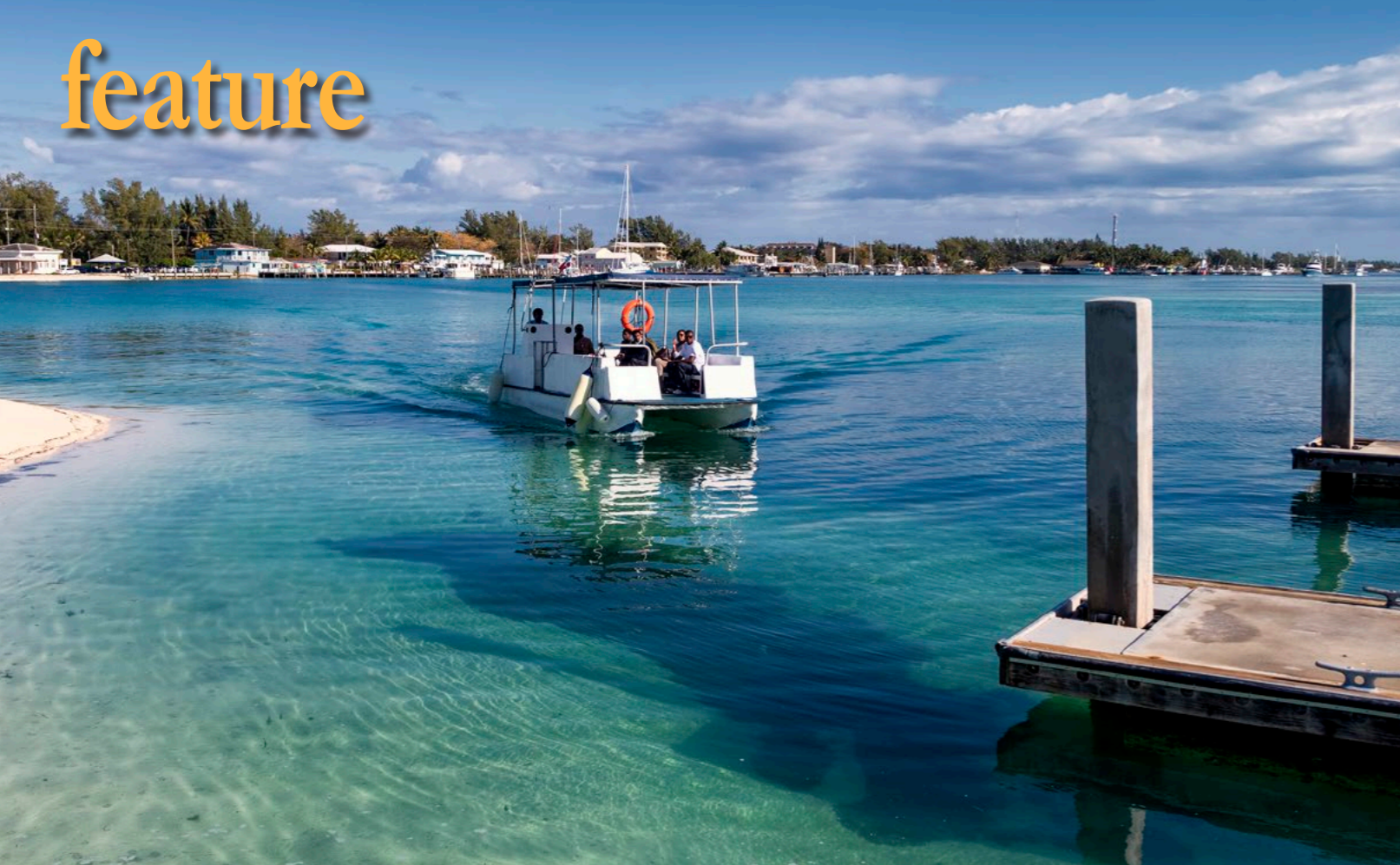
A ferry (above) travels between North and South Bimini; Great hammerhead shark on night dive (right)

the areas it touches. The current is rich with larvae swept up as the Gulf Stream flows up from the Gulf of Mexico. Those larvae thrive in the current and are deposited at landfalls along the way, with the islands of Bimini being the first major way-point.