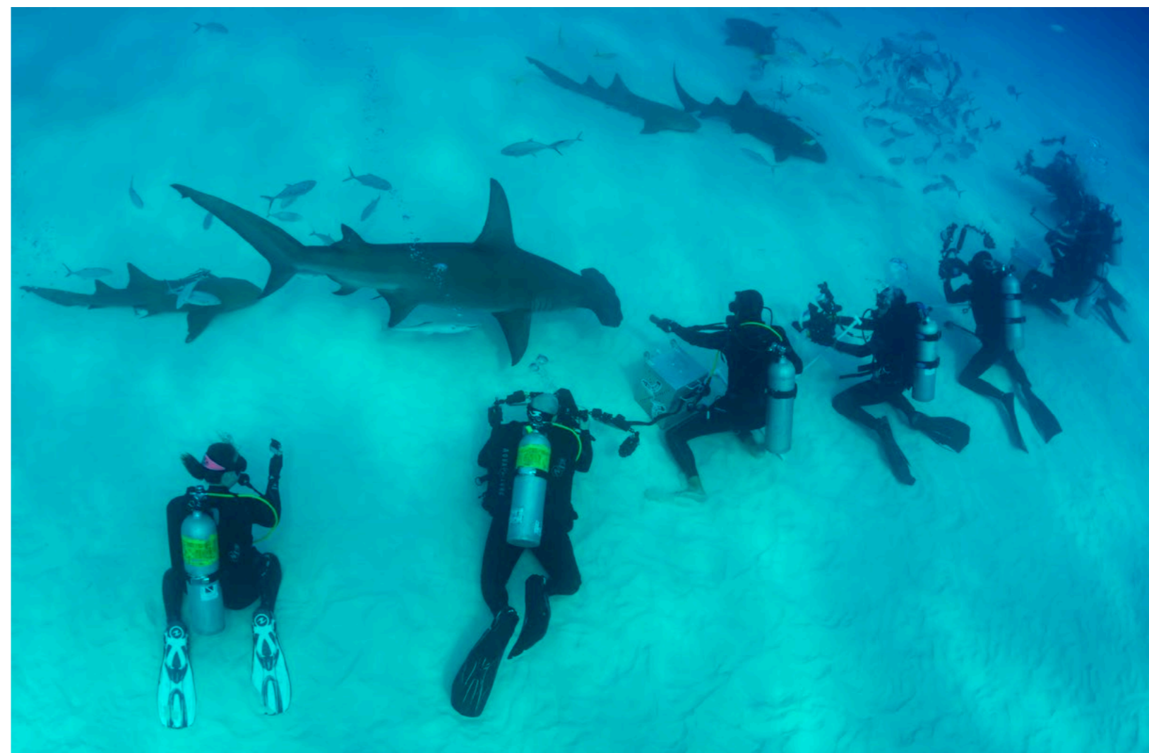
Divers photograph hammerheads as they approach the feeder; Staff prepares chum for shark-feeding dive (top right)

Hammerheads are known to be aggressive hunters that feed on smaller fish, octopus, squid, and crustaceans but are not known to attack humans unless they are provoked. In Bimini, they are tempted to swim close to divers, by feeding them, and the whole