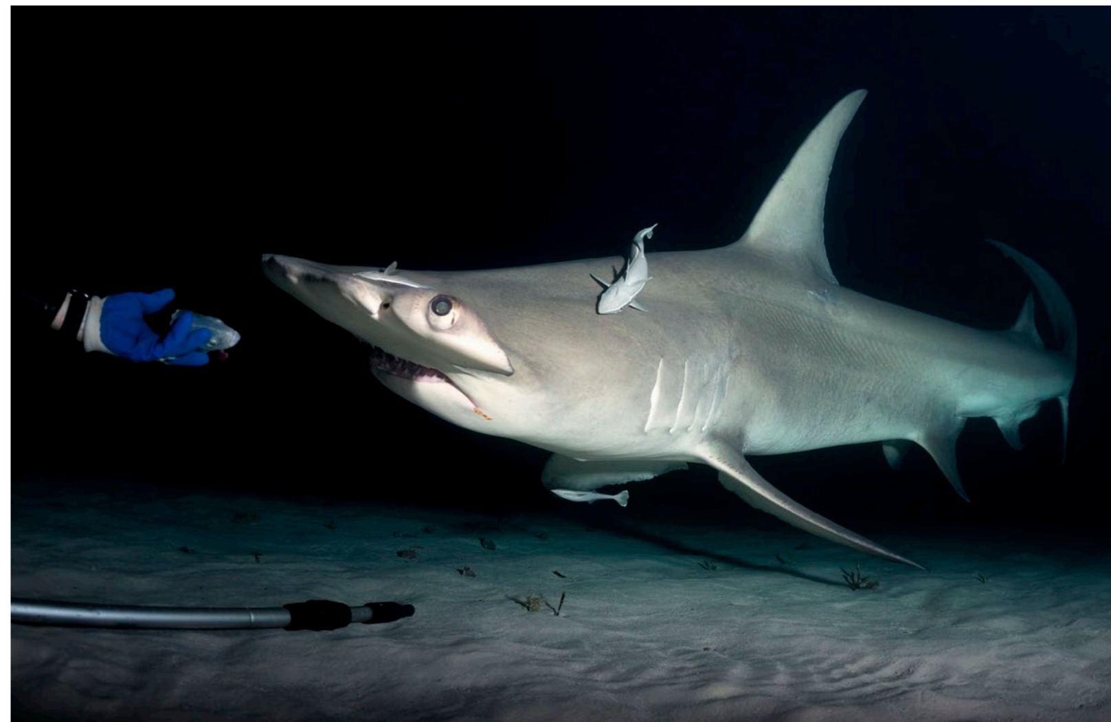
Hammerheads approach the feeder on a night dive (above, left and top right)

flicks the bait upwards, and the shark gets it with the first chomp. But things can get a bit hectic around the bait box, and when they do, you really do know it was the right decision to bring that big DSLR.